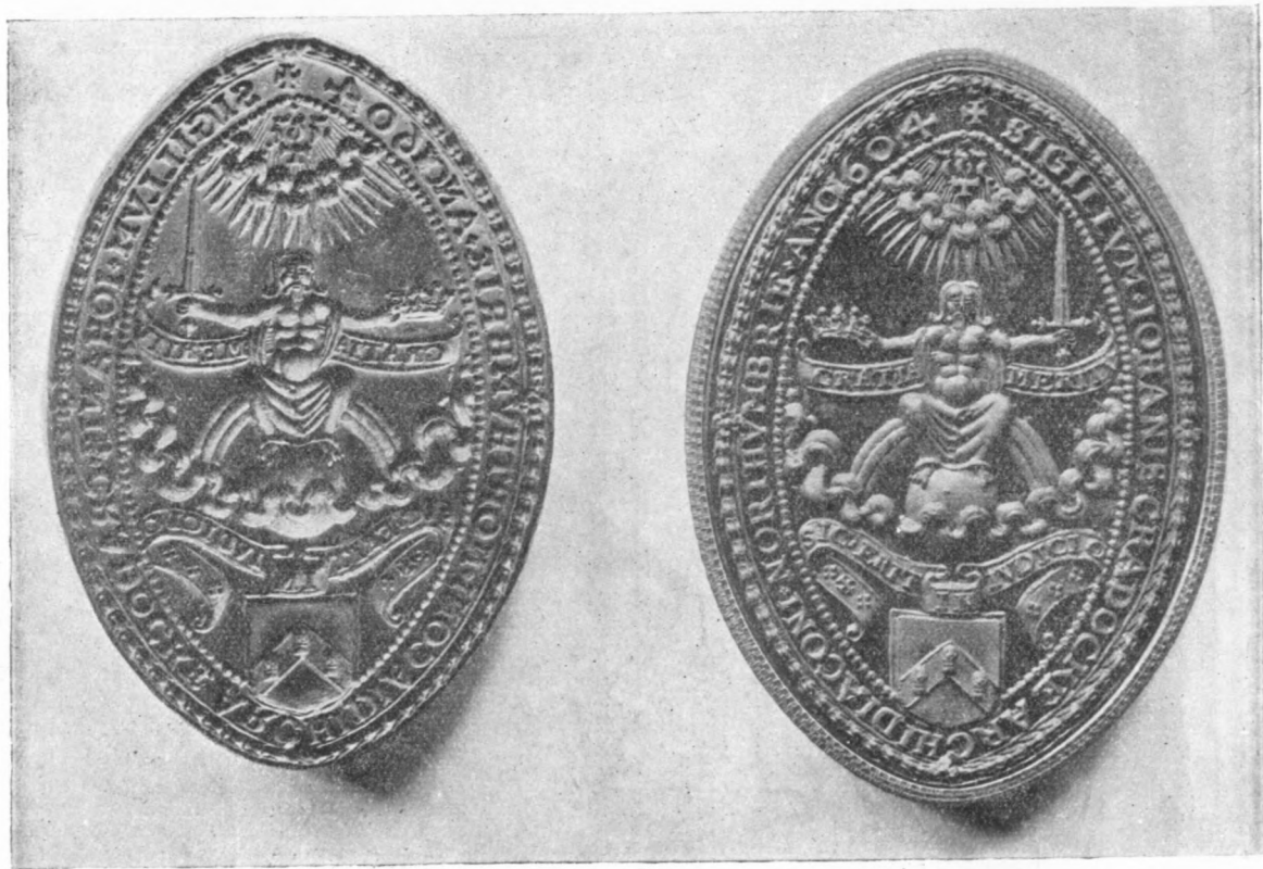
MATRIX AND IMPRESSION ( \frac{1}{2} ) OF THE SEAL OF 1604 OF DR. JOHN CRADOCK, ARCHDEACON OF NORTHUMBERLAND.

(See pp. 122 and n. , 124-126 and 128; also Arch. Ael. , 3 ser. xv, pp. 44 and 45.)