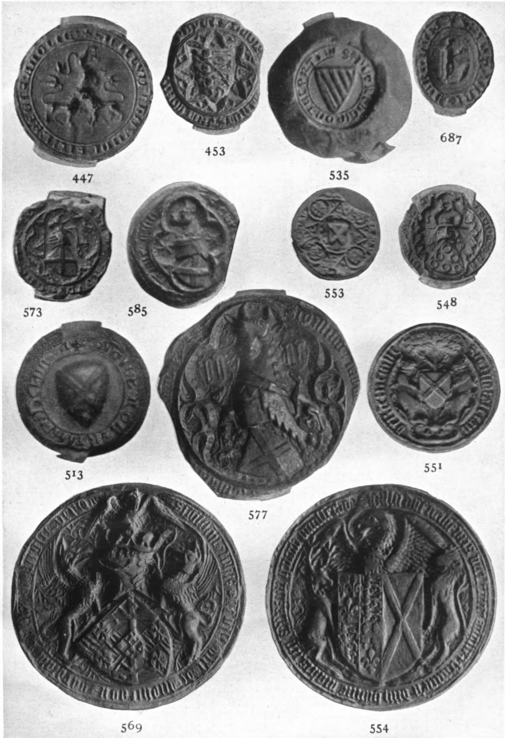
NORTHUMBERLAND AND DURHAM SEALS. IV