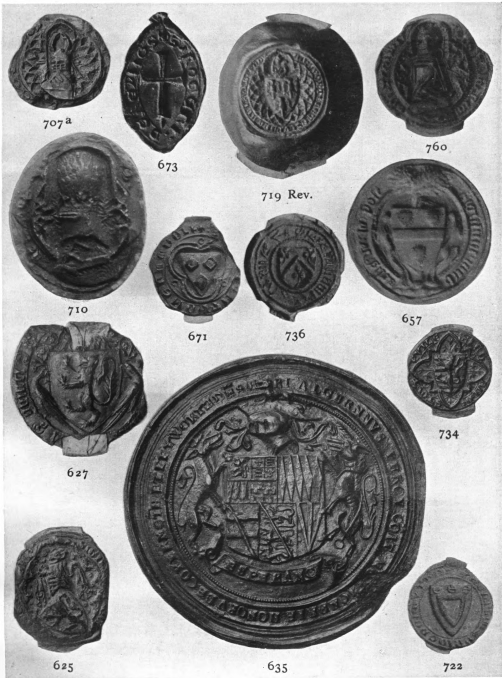
NORTHUMBERLAND AND DURHAM SEALS. V