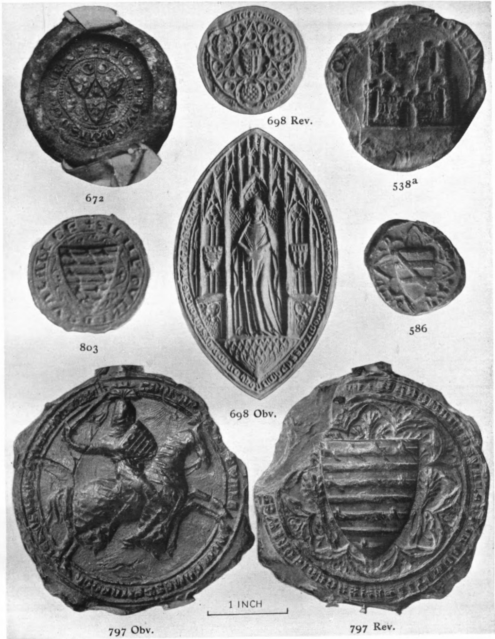
NORTHUMBERLAND AND DURHAM SEALS. VI