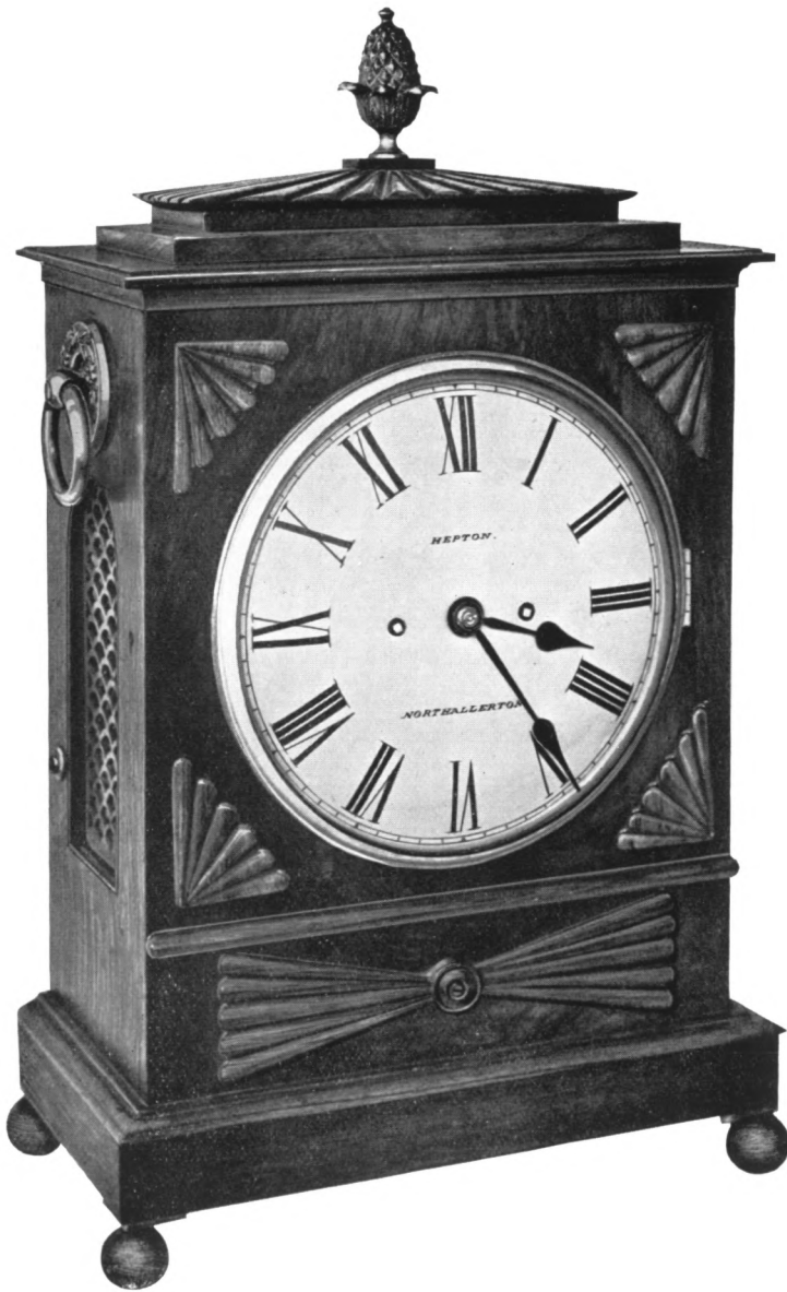
BRACKET CLOCK BY WILLIAM HEPTON, NORTHALLERTON.