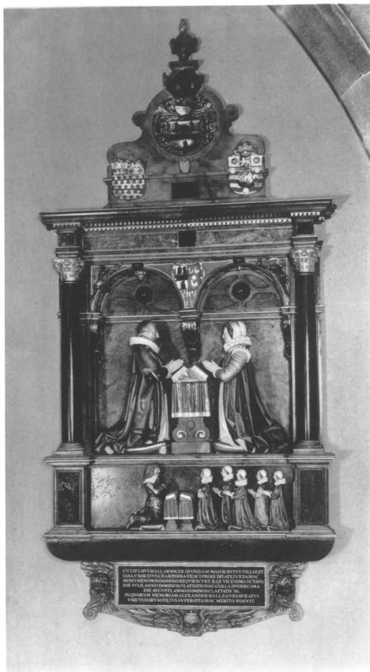
THE HALL MONUMENT.