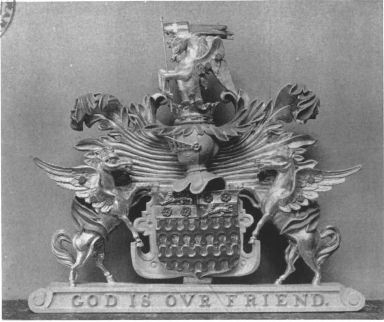
Fig. 2. ARMS OF MERCHANT ADVENTURERS.