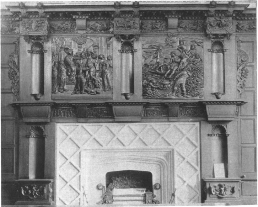
Fig. 1. FIREPLACE AND OVERMANTEL, MERCHANTS' COURT.