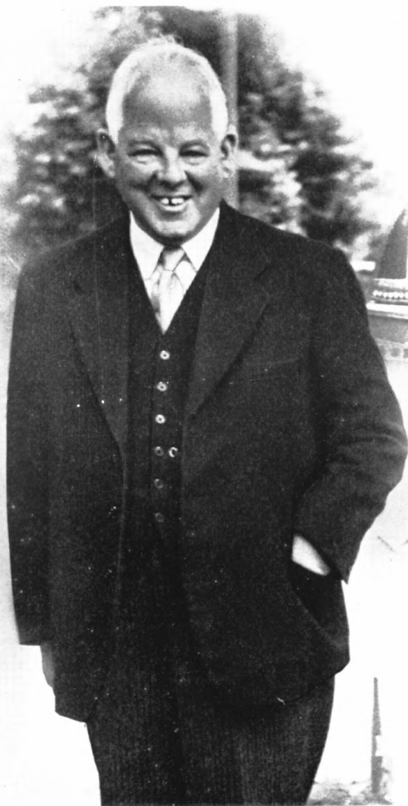
SIR IAN RICHMOND