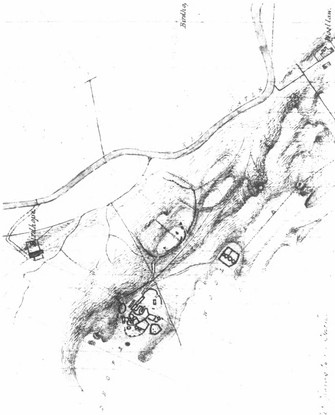
Plate IX. Birdhope and Woolaw, Redesdale.