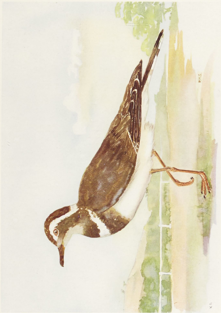
FORBESS BANDED PLOVER (See page 74)