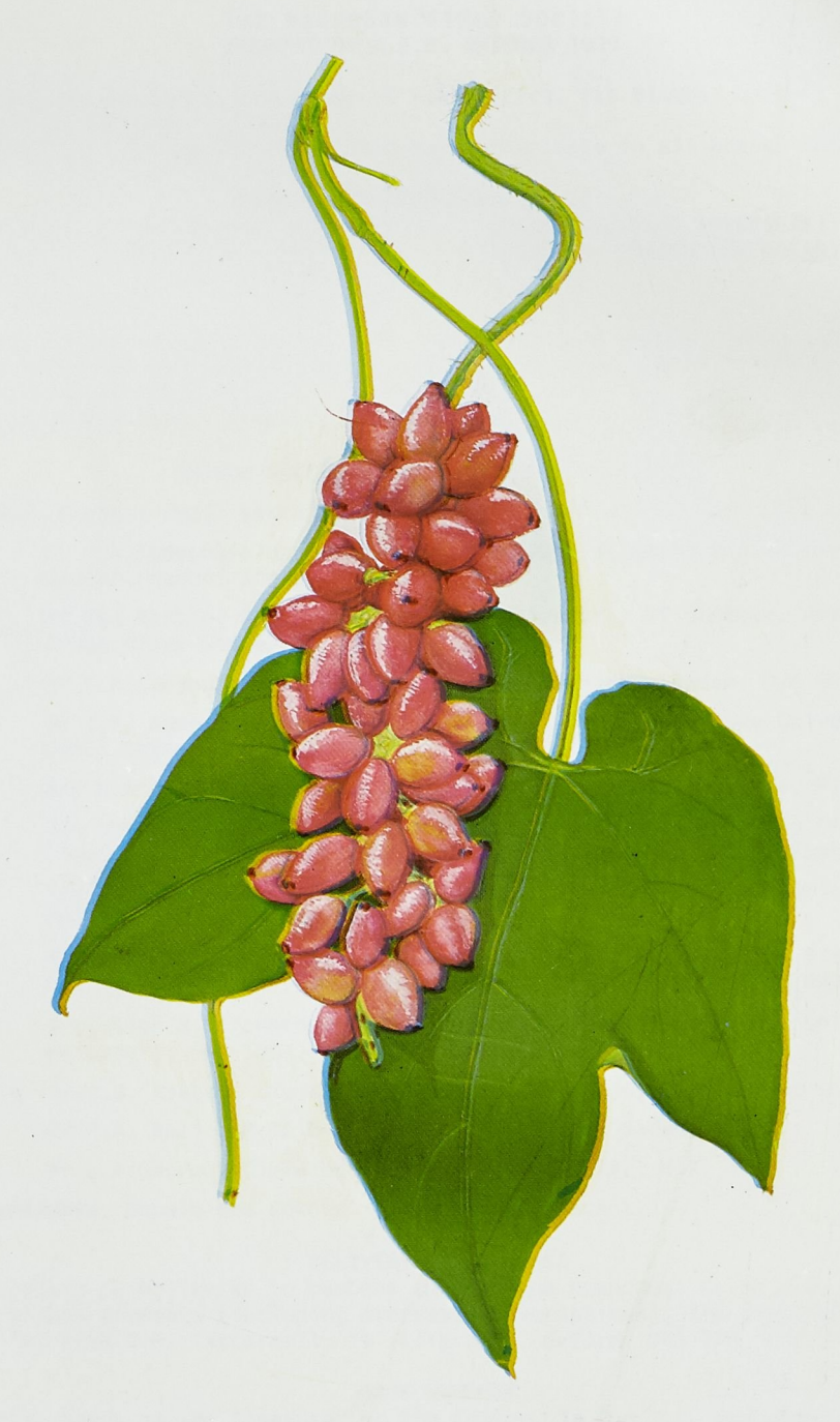
Dioscoreophyllum cumminsii (Serendipity berry)