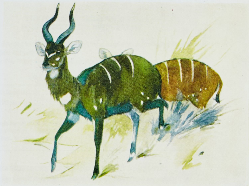
Sitatunga ( Tragelaphus spekei )