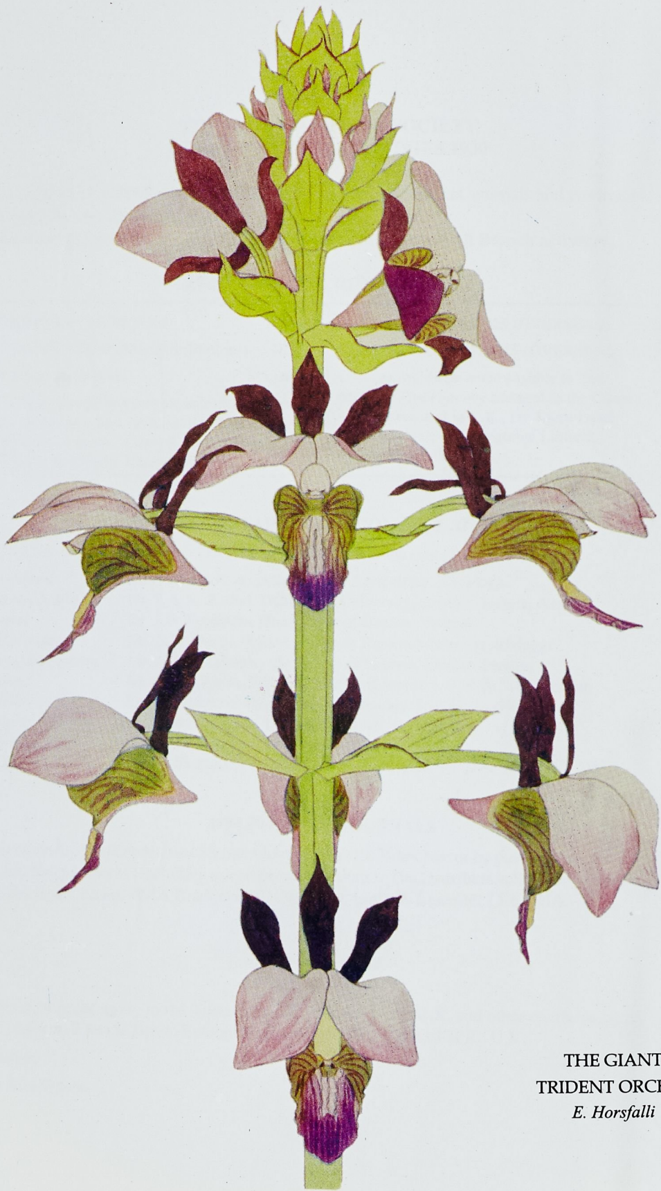
THE GIANT TRIDENT ORCHID E. Horsfalli