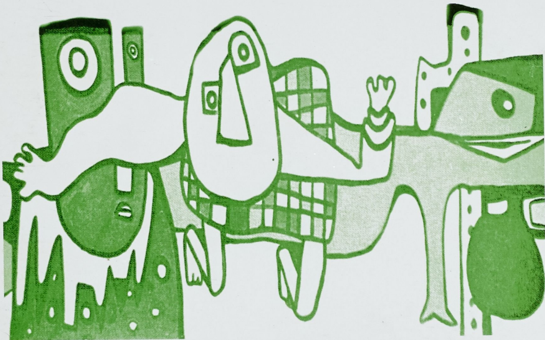
Detail of mural at Ori-Olokun Centre, Ile-Ife, 1968.