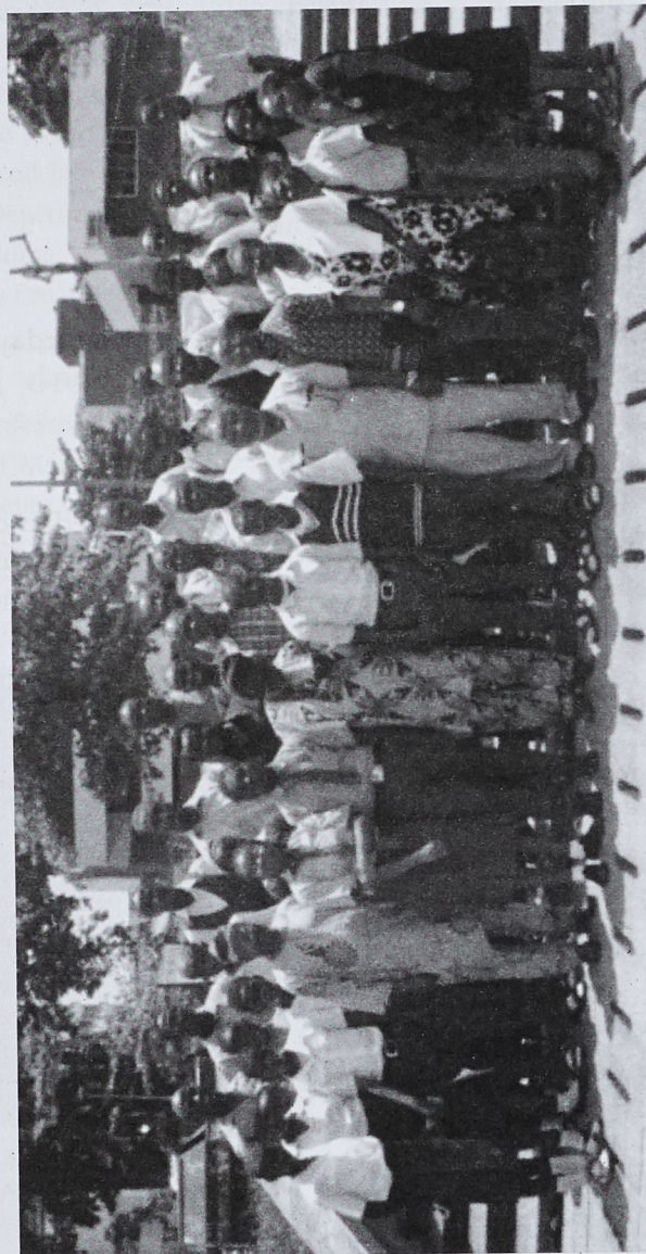
Students and members of the Nigerian Field Society after the quiz competition at the ABM April 2012 (Ile-Ife) and the 40 th anniversary of the Ife Branch.