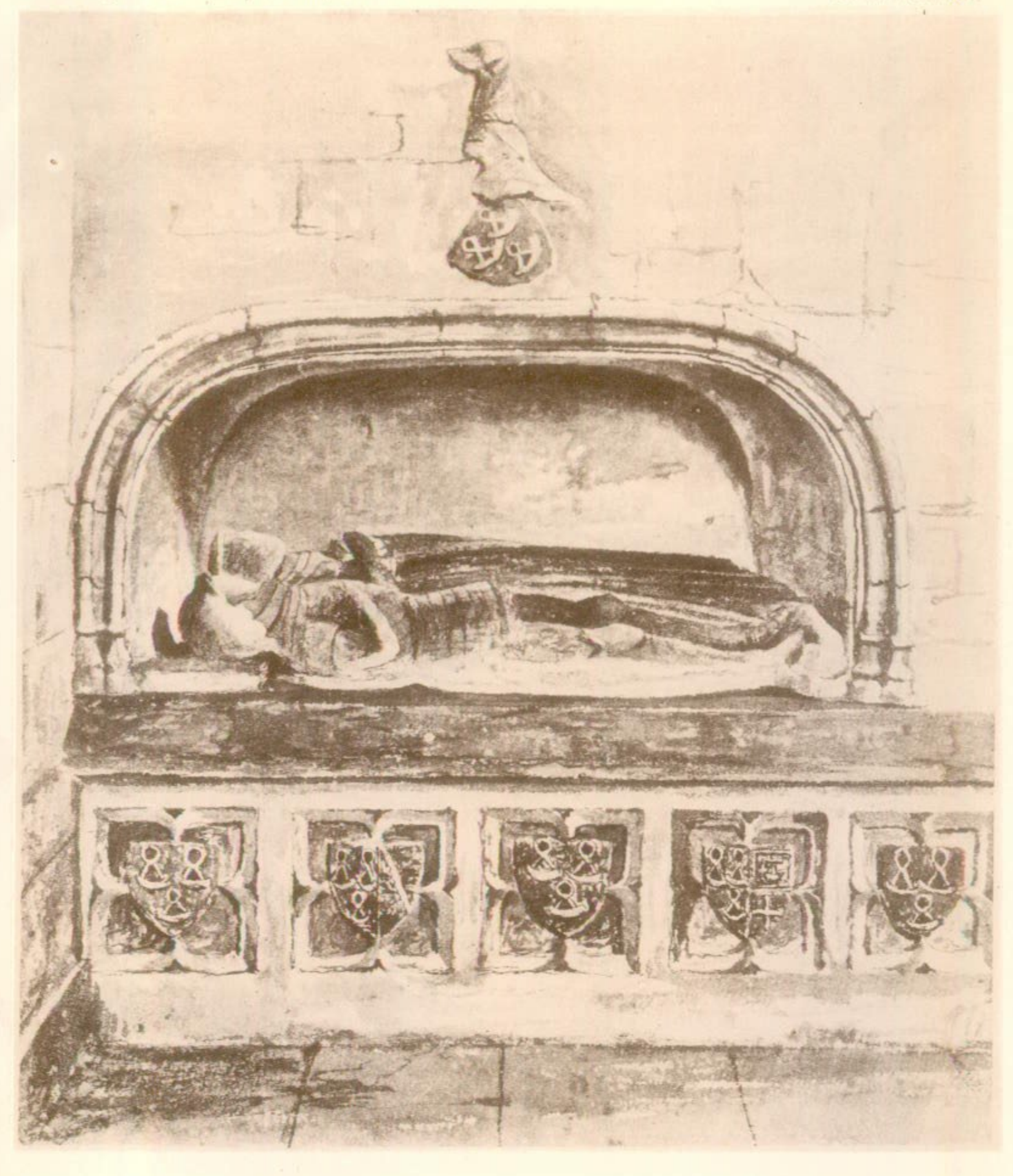
MONUMENT OF SIR JOHN FORRESTER OF CORSTORPHINE. (1440)