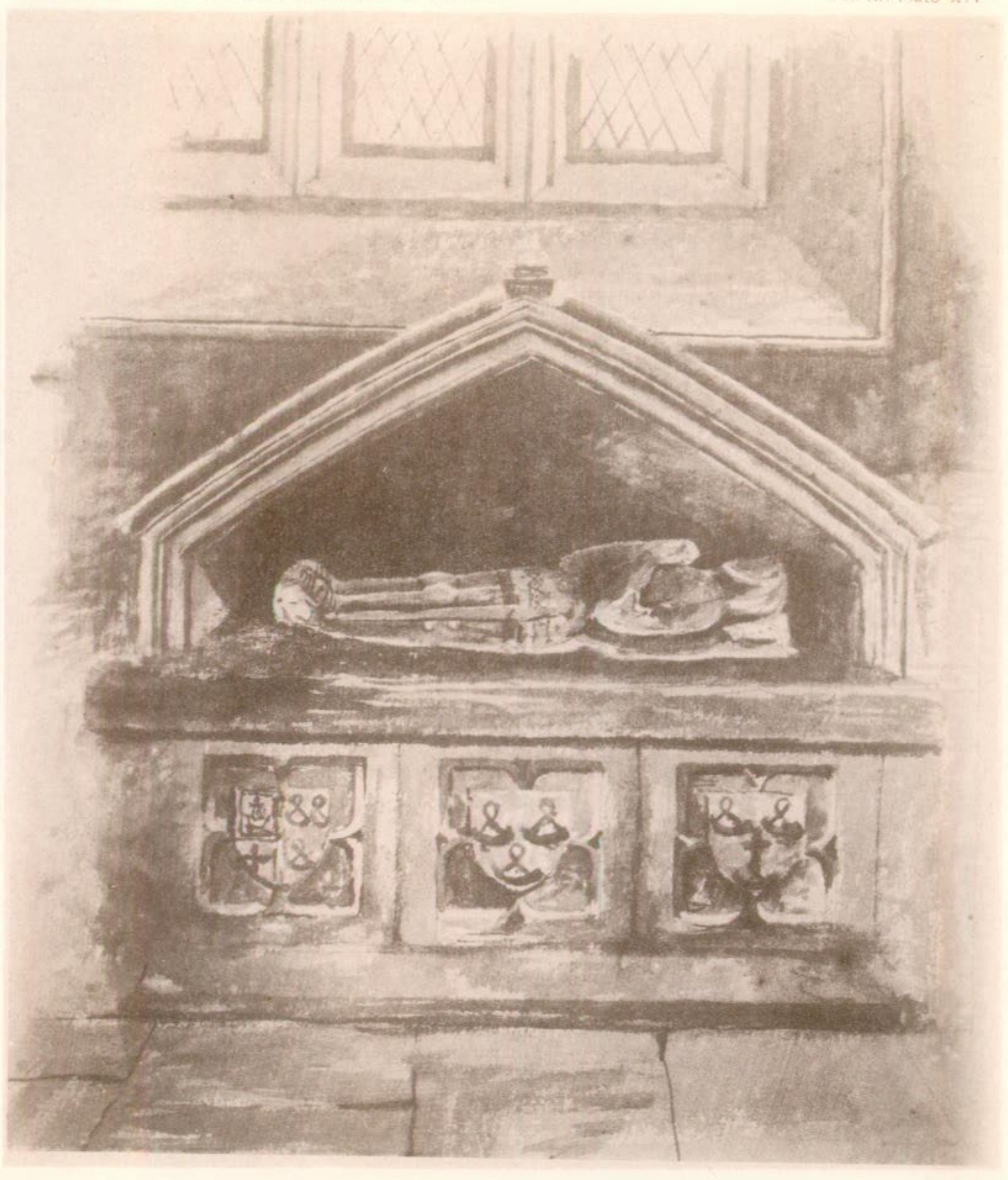
MONUMENT OF SIR ALEXANDER FORRESTER OF CORSTORPHINE. (FROM A DRAWING BY W.P. BURTON)