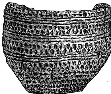
Fig. 1. Urn from Cist at Stannergate ( 4\frac{1}{2} inches high).

In the earth, exactly above the shell-bed, twelve cists were found, eight of which were long cists and four short. All contained bones, but in one only (one of the short cists) was there any other traces of man. This