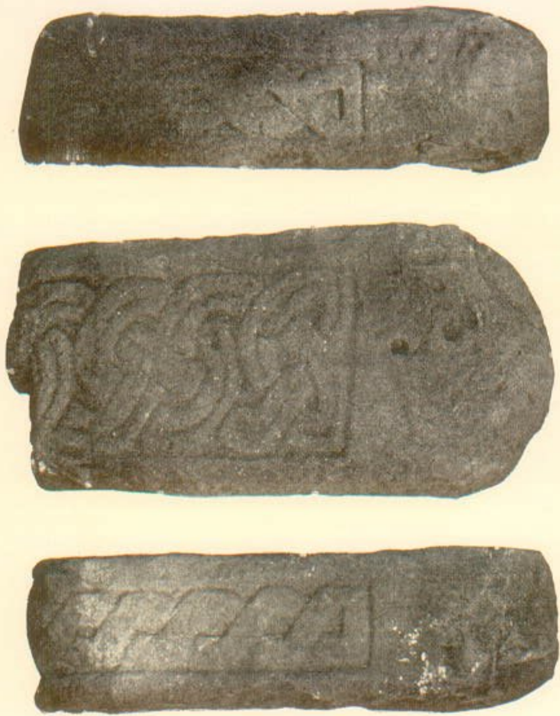
Fig. 1. Front and right and left sides of broken Cross-shaft found at Cairn, parish of New Cumnock.