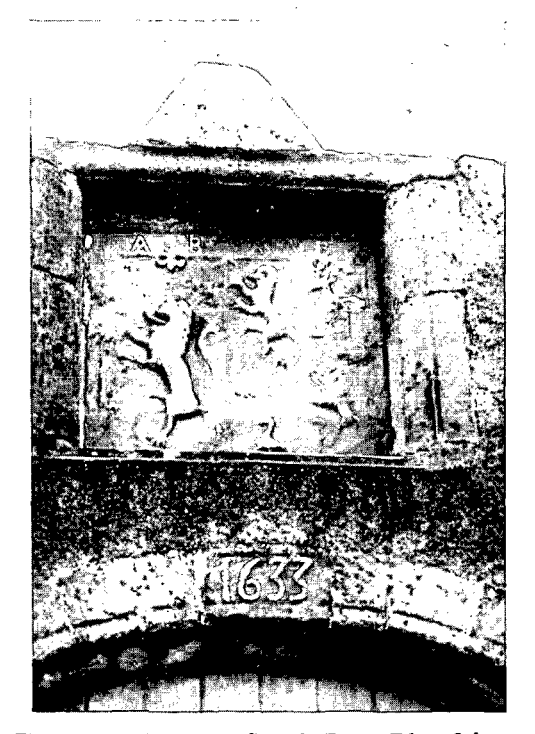
Fig. 1. Armorial Slab at Carrick House, Eday, Orkney.

Above the dexter half are the letters AB, and above the sinister half the letters MB. Below, towards the left-hand side, are the remains