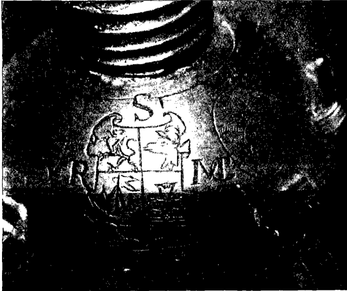
Fig. 3. Arms on Gourd.

it is important to note that whereas the identical coat depicted on the cups appears on Sir Rory Mor's gourd and part of the coat appears upon his tombstone (fig. 4) in Fortrose Cathedral ( Proceedings , vol. xlvii. p. 118), one cannot find in document, sculpture, or plate in the possession of the MacLeods of Talisker any of the arms displayed on the cups. On the contrary, it can be proved by the evidence of seals and an examination of Sir Roderick MacLeod of Talisker's tombstone in Eynort Churchyard,