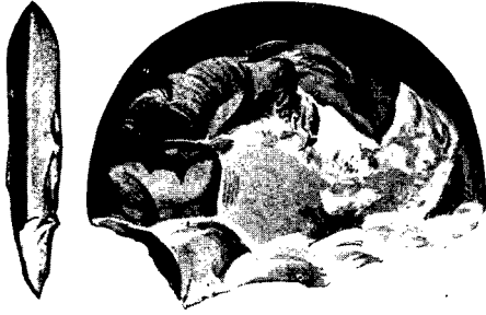
Fig. 1. Ground Flint Knife from Challoch.

Leaf-shaped Arrow-head of whitish Flint, measuring 1\frac{9}{16} inch in length and \frac{3}{4} inch in breadth, found near Milton Loch, parish of Urr.