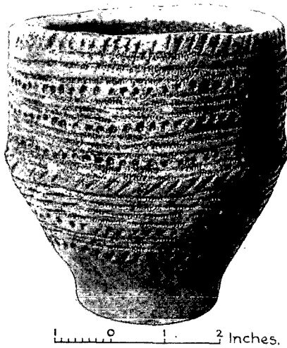
Fig. 1. Food-vessel found at Rungally, Fife.

Two days later, on 30th April 1931, another cist was found about 6 yards west of the above described. It was lying about south-west by west and north-east by east. There was no stone cover upon it, and the inside measurements were 42 inches in length by 21 inches in width