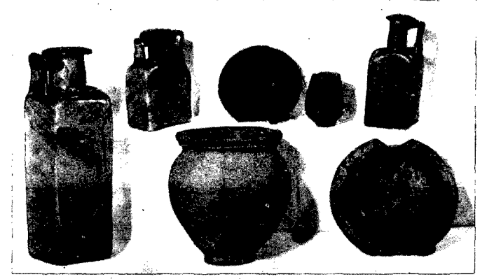
Fig. 3. Vessels of Glass and Pottery from a grave at Baldock (Group 102).

This group consists of a cinerary urn, together with a small Samian cup, which formed a lid for an ovoid black-coated vase. With one exception, this vase was the only vessel devoid of earth and stones, the other one being a very large cinerary urn containing cremated remains, a Samian dish—potter's name Reginus—serving as a lid. Incidentally, this large globular urn took me two hours to disinter in pouring rain.