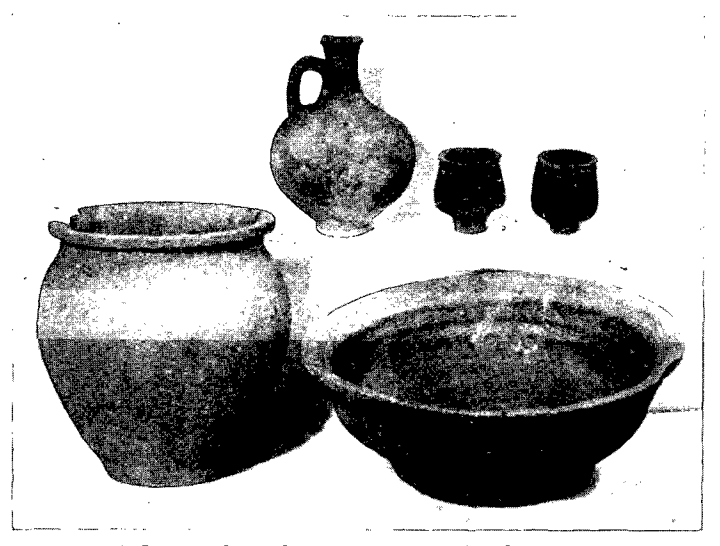
Fig. 1. Pottery Vessels from a grave at Baldock (Group 3).

This group was fortunately undisturbed, but the previous ten groups