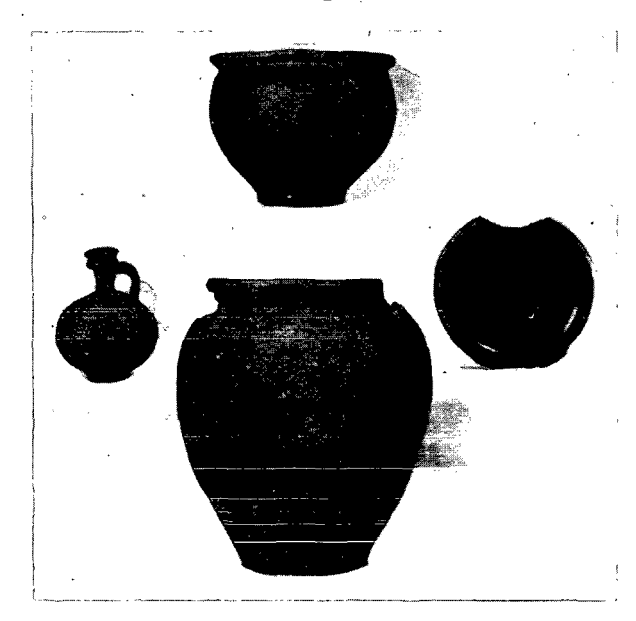
Fig. 2. Pottery Vessels from a grave at Baldock (Group 51).

The feature of this group is two jugs and a hare and hound Castor ware vase, the hare and hound being in dotted panels with floral scroll,