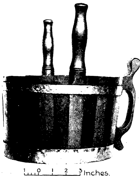
Fig. 1. Bride's Coggie from Stromness, Orkney.

Bride's Coggie, formed of wooden staves and girded by two iron hoops. On opposite sides a stave with a turned top projects upwards 4\frac{7}{8} inches