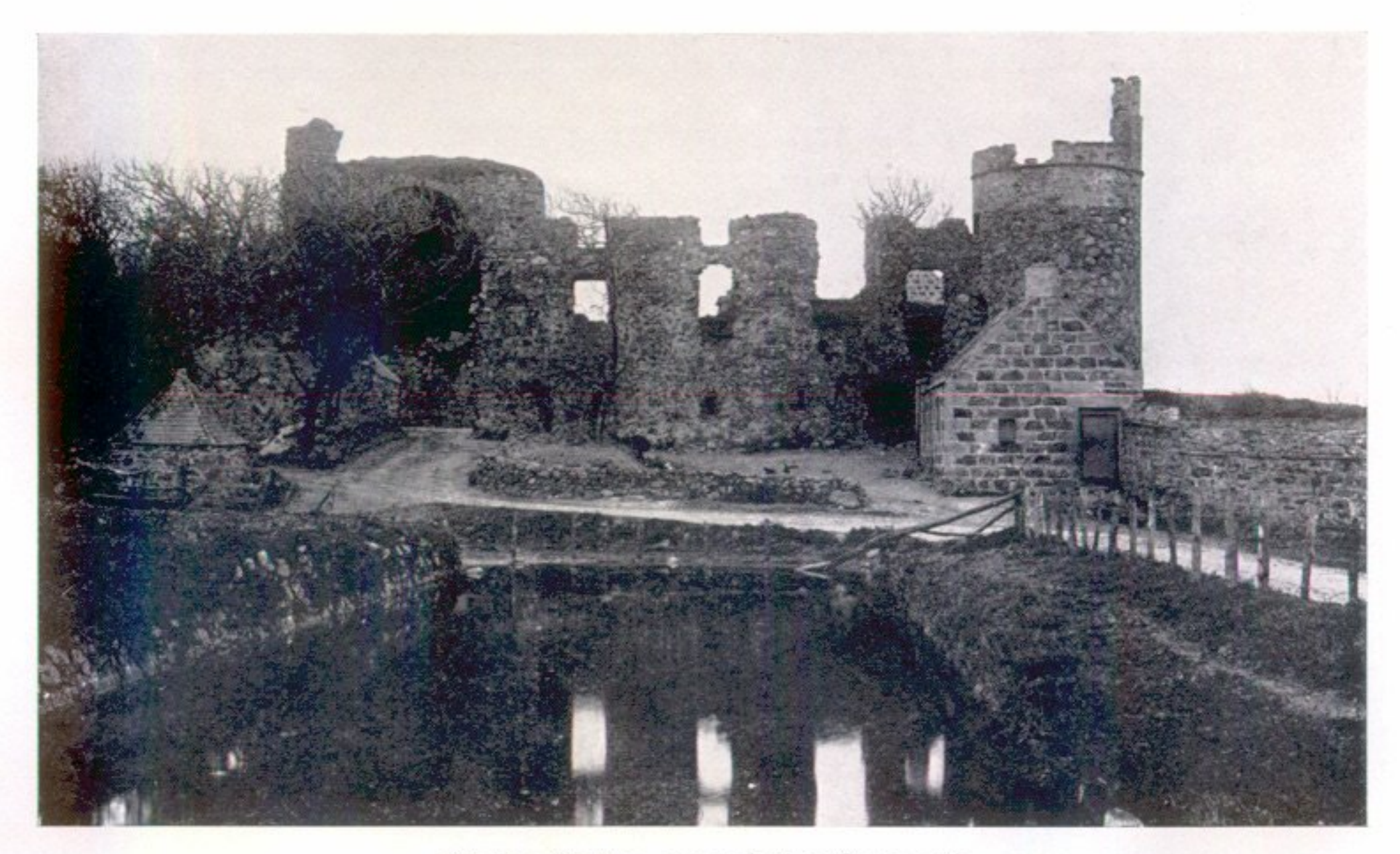
Pitsligo Castle: general view from east.