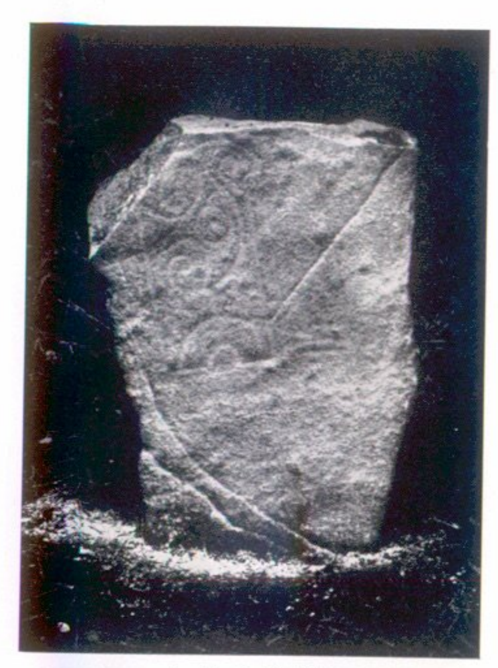
1. North Redhill.