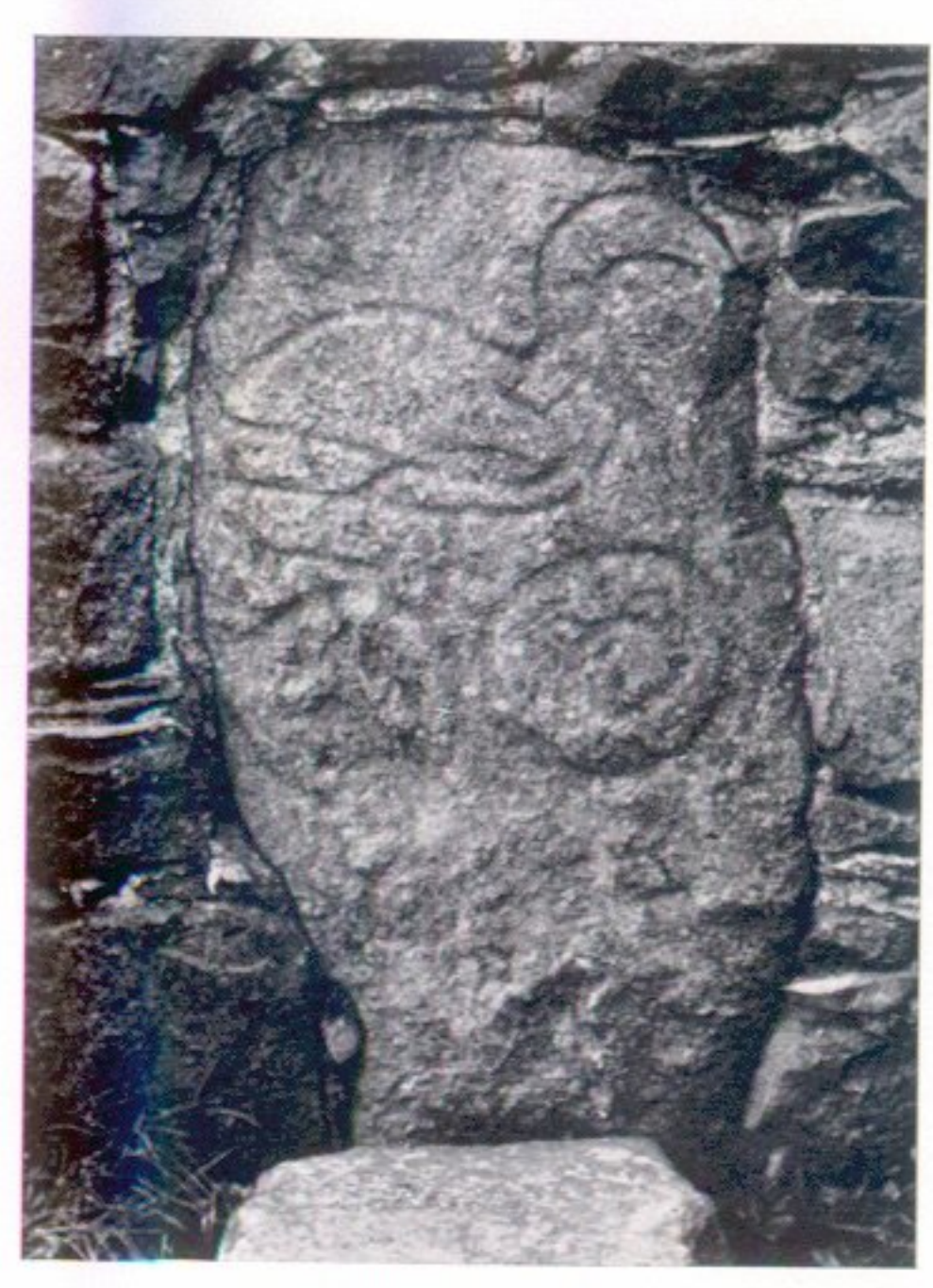
3. Tillytarmont No. 1.