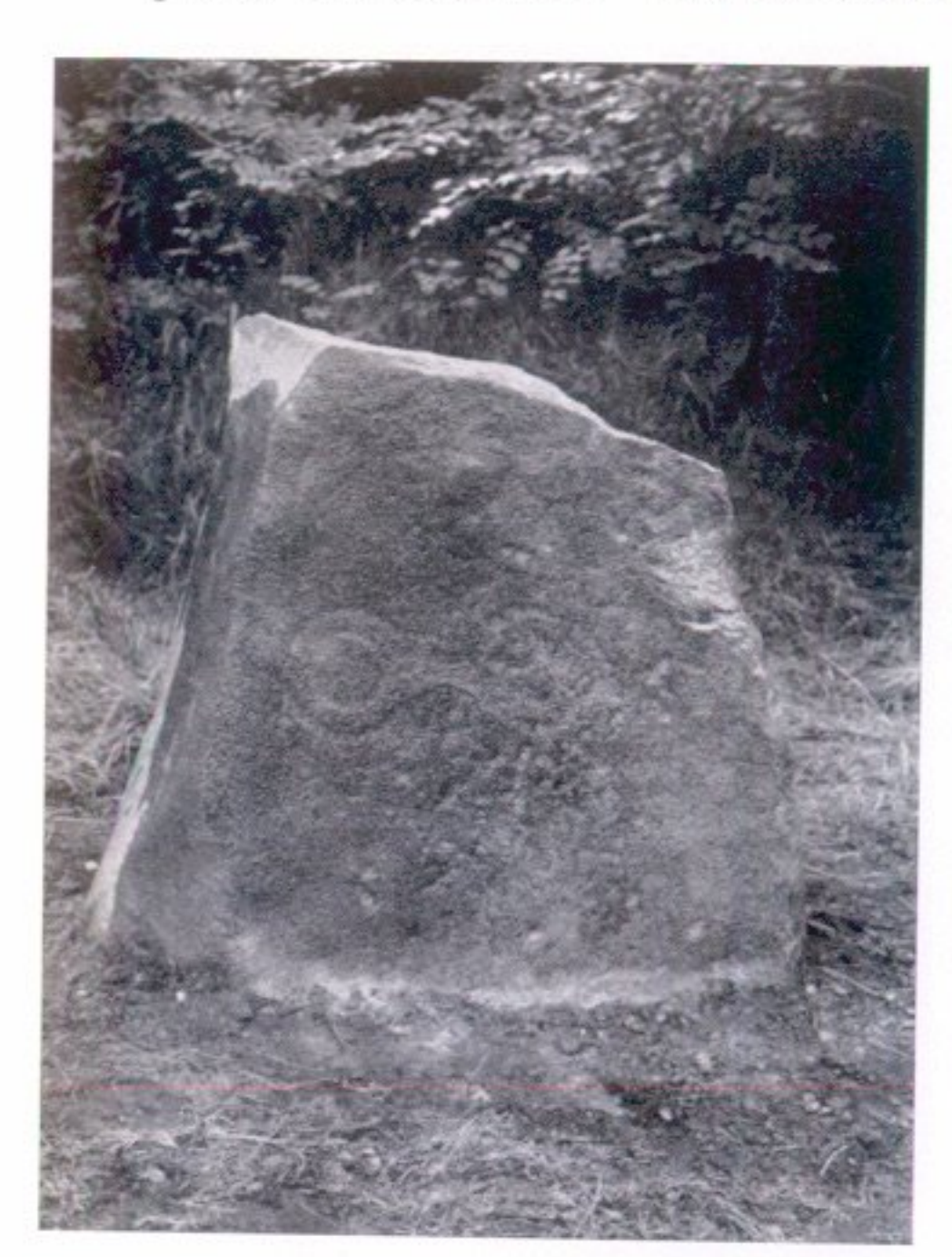
2. Tillytarmont No. 2.