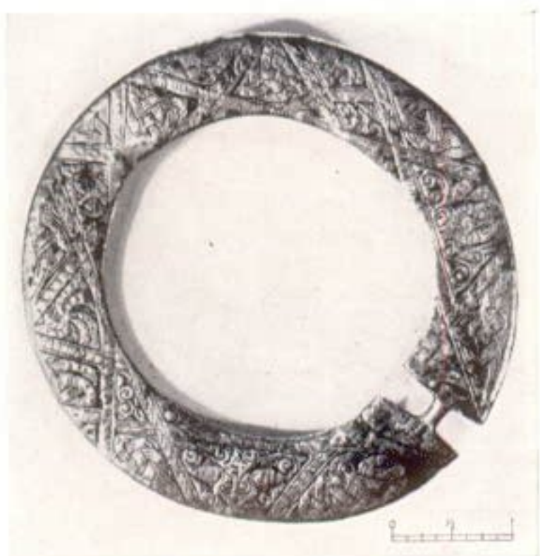
Ring brooch from Rannoch