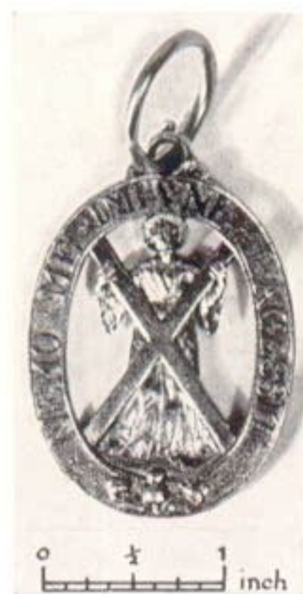
Gold St Andrew medal