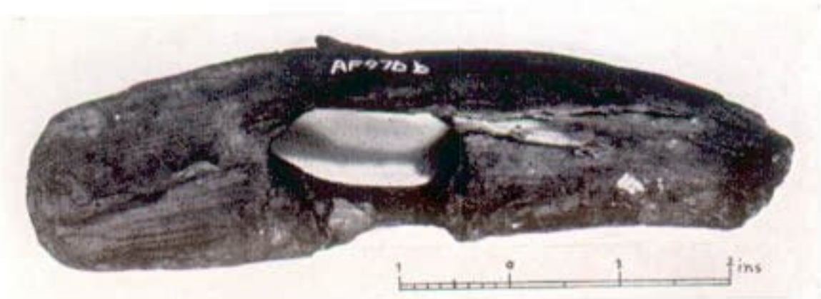
Axe and rowan haft: Coll, Lewis