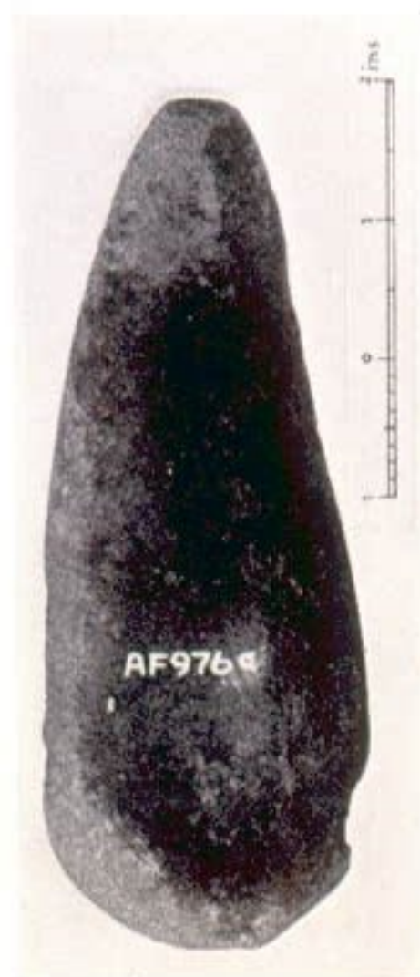
Axe: Coll, Lewis