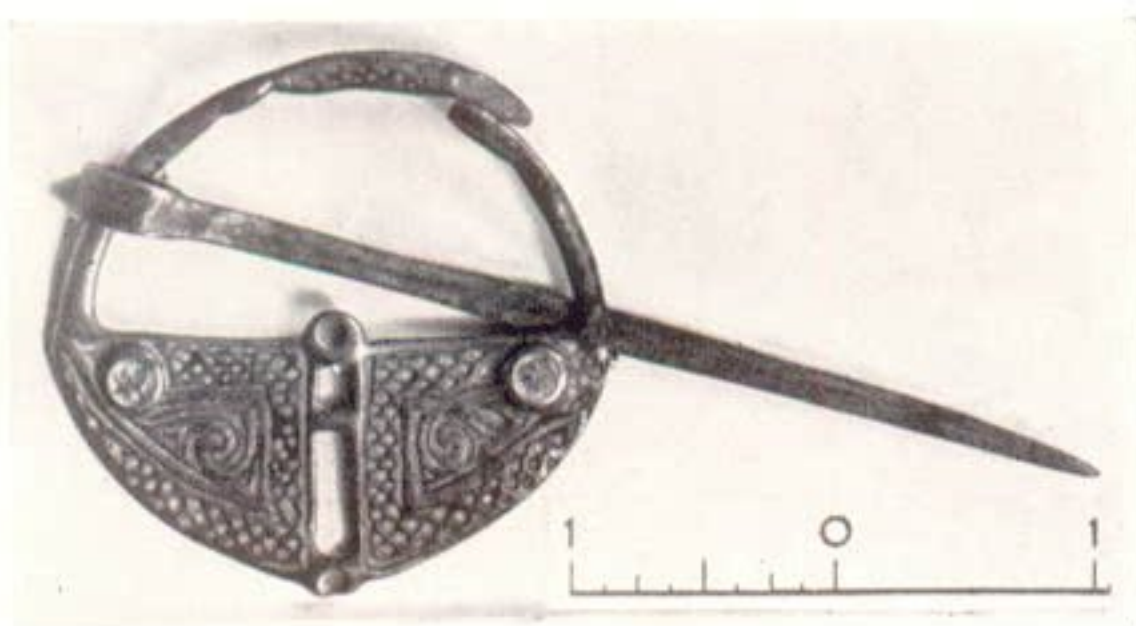
Brooch from Ireland