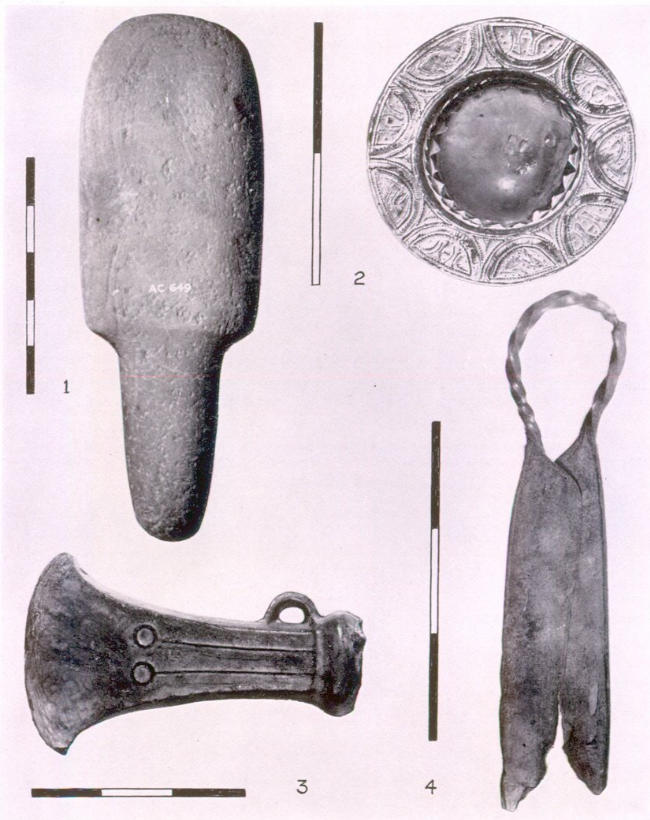
1. Stone club, Brae, Shetland. 2. Silver and crystal brooch, 16th-17th century. 3. Bronze socketed axe, Loch Glashan, Argyll. 4. Bronze shears from souterrain, Loch Erribol, Sutherland (Scales in inches)