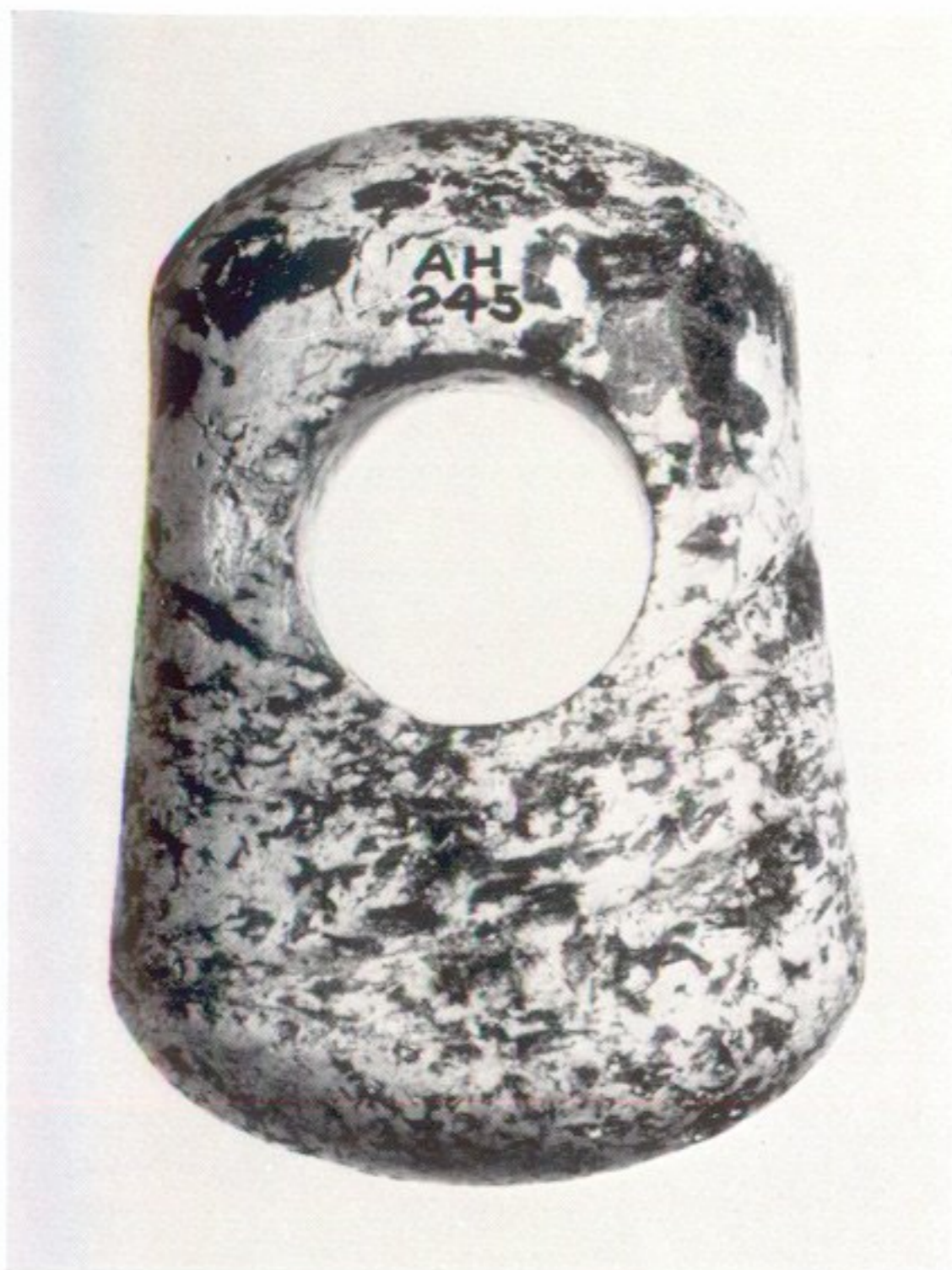
Stone mace-head from Tarbert, purchased by Museum