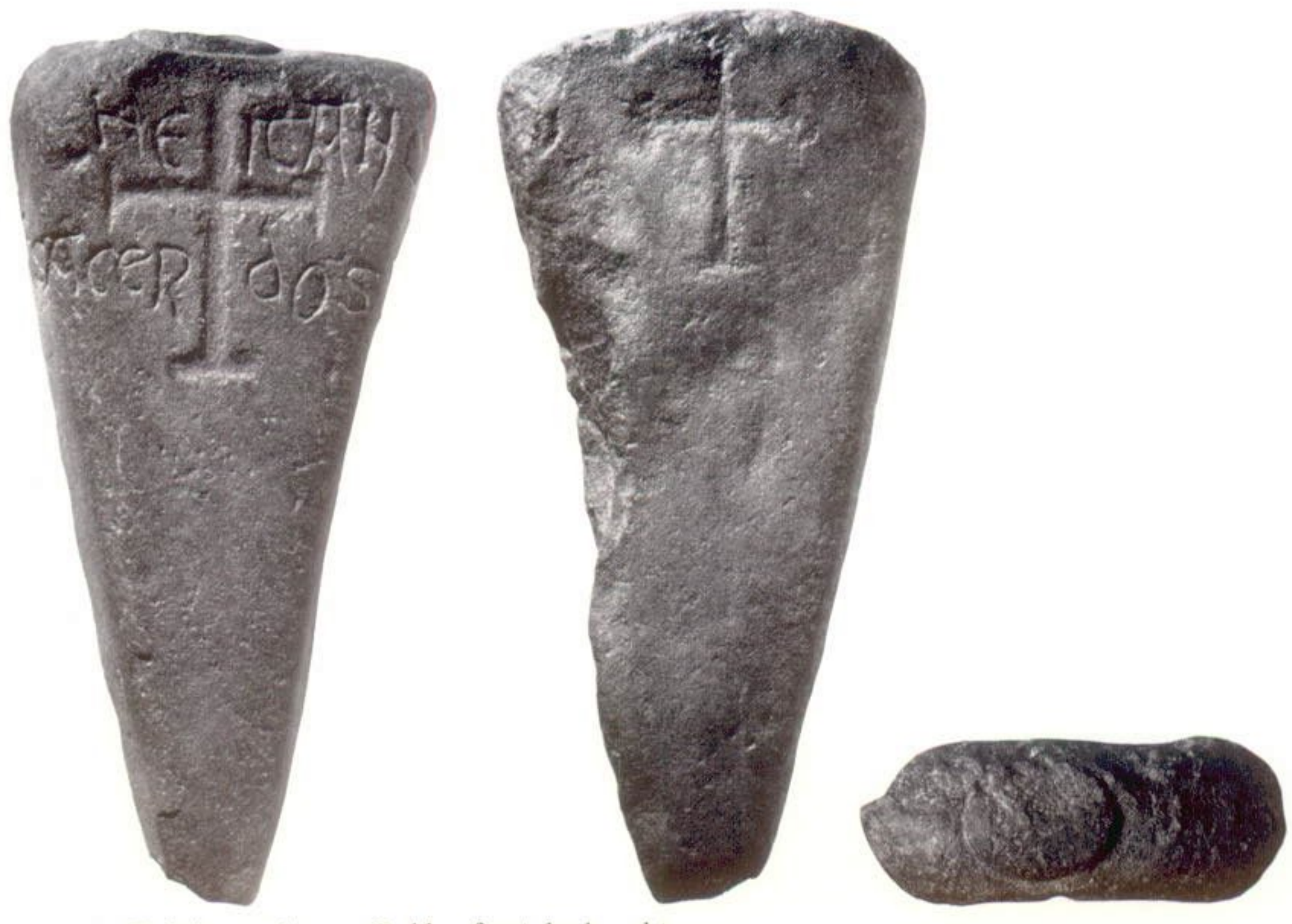
a Early Christian tombstone, Peebles; front, back and top