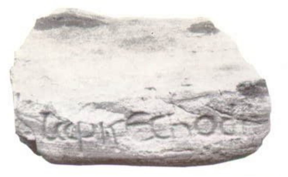
b Early Christian 'grave-marker', Iona; front and top