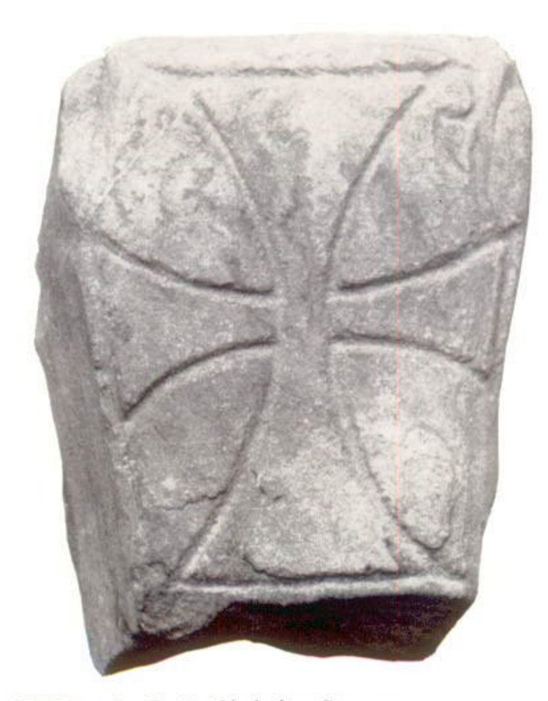
STEER | Early Christian Stones