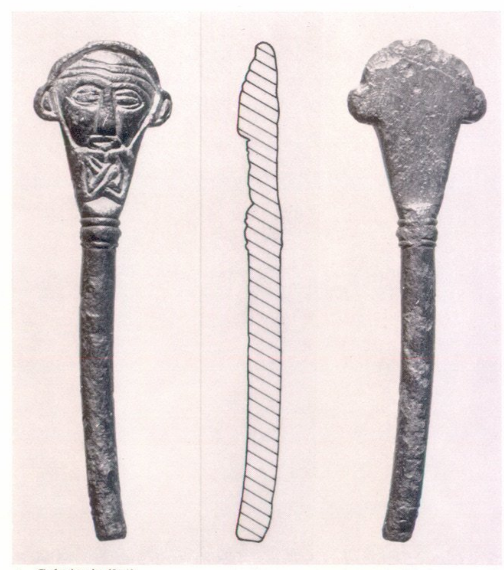
a Golspie pin (2:1)