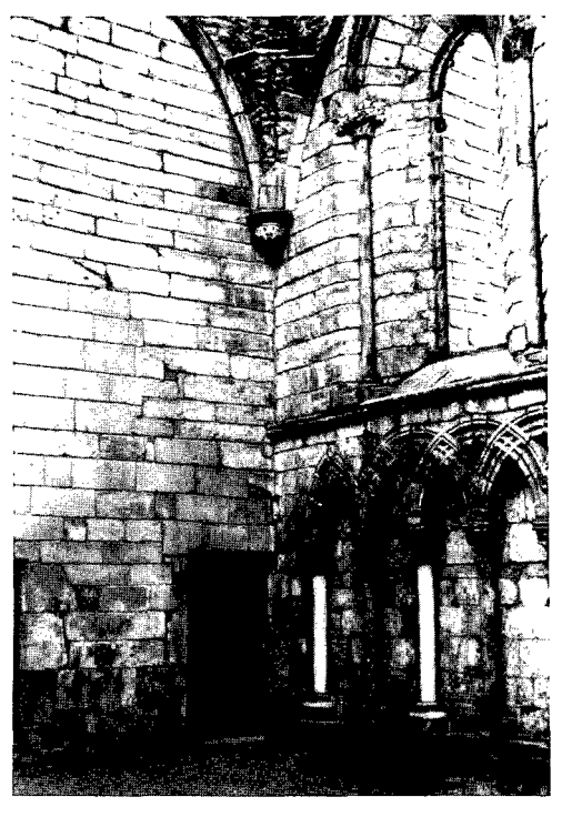
ILLUS 2 Holyrood Abbey: interior, junction of north aisle wall (right) and east wall of tower (left)

instead it has been suggested that they are evidence that a new master-mason took over whose 'activities must have been confined to the W wall of the nave and the W front . . .' (Wilson in Gifford et al 1984, 133-4).