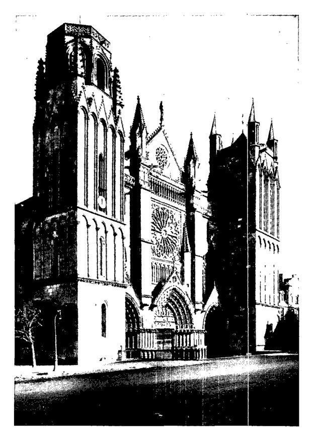
ILLUS 4 Poitiers Cathedral: west façade, c 1200 to after 1500

the advanced flanking position, although already before the new work at Holyrood had started, the façade arrangement at Santiago was being converted into a more usual design by the construction of the narthex between the towers. The façade of the rather small cathedral at Mazara, a considerable distance from Santiago, may have been contemporary. Begun approximately 10 to 15 years after Santiago, its façade must have been in construction at much the same period, the beginning of the 12th century. If Mazara did, indeed, have its west towers in the advanced flanking position, it obviously was the model, later in the century, for the cathedrals of Cefalù and Monreale, the façades of which were most likely constructed immediately prior to that of Holyrood, c 1200. The foundations of the towers of the façade of Poitiers also belong to the same years, although, as usual, there is no way of telling if west towers in the advanced flanking position were intended when work began in 1162.