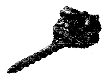
ILLUS 16 Nail partially enveloped in vitrified material

shovel on a Drott caterpillar tractor. The material thus extracted from the wall was spread for the crew to check for signs of vitrification, while the author remained at the wall to supervise the extraction and to check for the presence of any substantial lumps of vitrified material. A small portion of the north-west core of the wall was removed by this means. In so doing, much of the south-west revetment of the wall, which had looked very unstable at 08.30 hrs, fell away, but the core materials behind it, retained by the timber lacing, remained substantially intact (illus 12). No substantial blocks of vitrified stonework were revealed in situ , but small pieces were recovered from the core of the wall, where, as has been remarked above, there were timbers still alight. These small pieces (illus 13–16) were noted amongst the material spread from the Drott's shovel, and came from approximately 1–1·2 m above the ground level, roughly the level of the second row of transversal timbers.