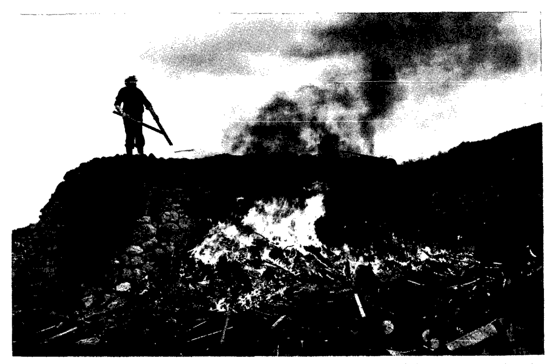
ILLUS 8 Removing partially-burnt debris of off-cuts from the wall-head; the tarpaulin has been removed from the north-west end, and lies folded at its base. Note that some of the facing stones display cracking

At about this time, the writer clambered on to the top of the wall. The earth and turf capping had baked slightly; smoke was emerging in small quantities from cracks in this surface (illus 8). A small hole was gouged out of this upper layer by hand to expose the small gabbros below; these proved to be only mildly warm to touch. Smoke was no longer appearing from the north-east face of the wall, despite the fact that the transversal beams in the opposite face were continuing to glow red and were burning back slowly into the wall-core. A thermocouple was inserted along one of these channels to a point about 0.3 m beyond the position at which the particular beam was burning: the temperature recorded, 79°C, was well below the range at which vitrification might be expected to occur. It was assumed that cold air was still penetrating the wall-core in sufficient quantities for low temperatures to be maintained. In a few cases, particularly in the uppermost row of transversals, where the timbers had burnt back beyond the beam-holes, small rubble had cascaded down, making further activity unlikely as the beam-channels were choked. Retrospectively, the employment of this small material, with its tendency to smother the fire, may be seen to have been a serious error.