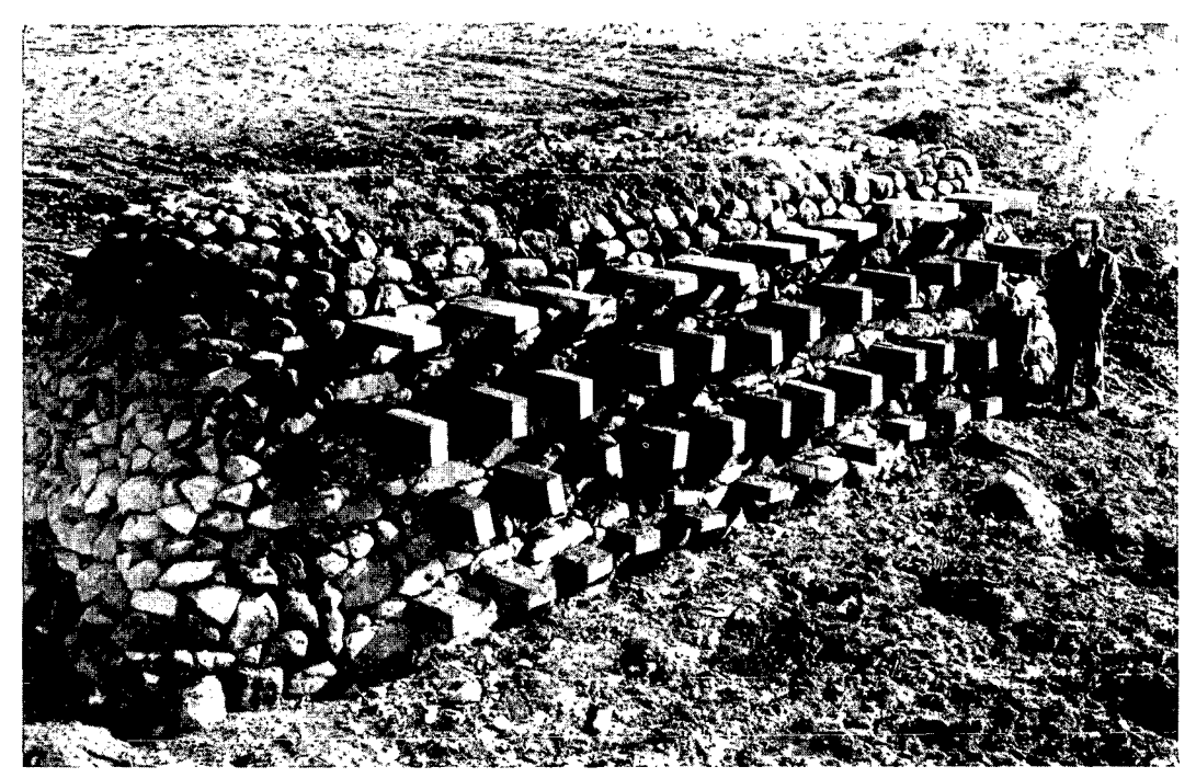
ILLUS 4 Oblique view of the completed wall, showing the south-west face and the drystone construction of the north-west end