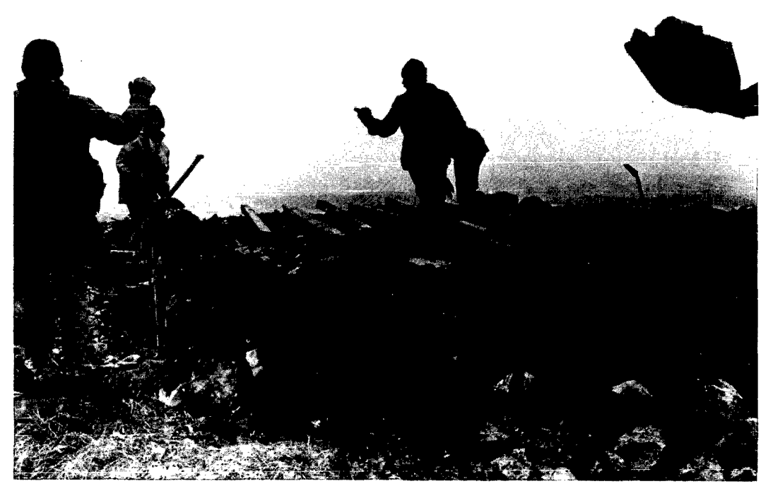
ILLUS 1 An early stage of the construction, looking north. The second row of longitudinals is visible on the surface

of the wall-faces was undertaken by Mr Robin Callander, who also supervised the remainder of the construction.