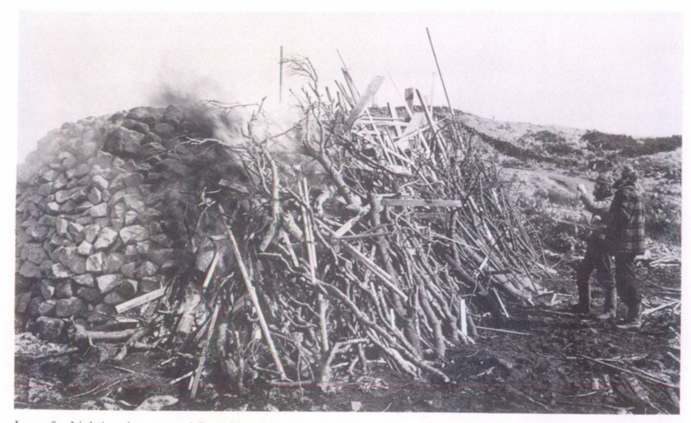
ILLUS 5 Lighting the external fire of brushwood and timber off-cuts against the south-west side just after noon