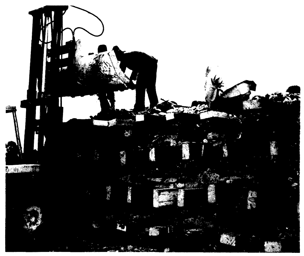
ILLUS 2 Small gabbro chips being added to the hearting of the upper part of the wall

the crew were employed essentially in moving wood and stone to the place of construction. The estimate may be presented thus: