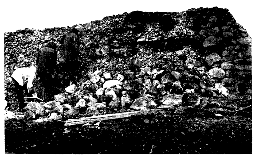
ILLUS 12 The south-east end of the south-west face after the collapse of the revetment, showing the substantiallyintact timber lacing

The next plan was to dig into the north-west sector of the south-west face using the mechanical