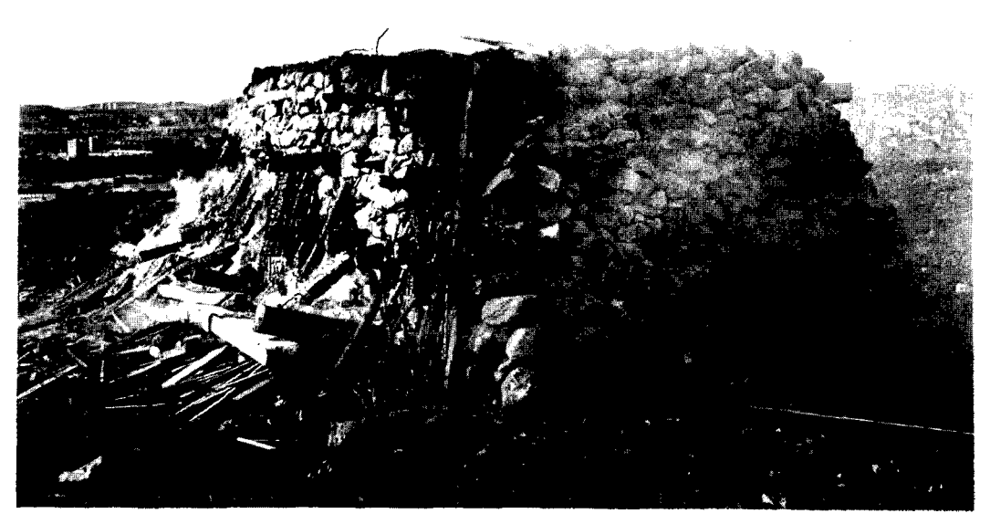
ILLUS 7 Smoke and steam issuing from the south-east end wall as the initial external fire burns down. Time: approximately 14.00 hrs