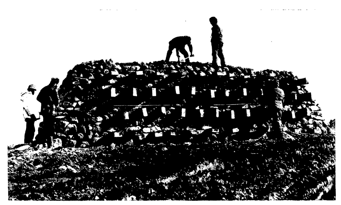
ILLUS 3 The wall nearing completion; measurement in progress as the final capping is spread on the wall-head

The first layer of timbers was inserted almost at ground level: eight of the slender timbers were evenly spaced out and arranged parallel to the principal wall faces; each subsequent horizon of longitudinal timbers used the same number of elements. The hearting at this level consisted essentially of the more substantial gabbros. The initial layer of transversals was incorporated at approximately 0.5 m above the ground surface, though this varied because of the sloping nature of the site. Each subsequent horizon of transversal timbers was off-set slightly, so that the centre-to-centre distance between the end transversals in the second horizon was 6.2 m. Moreover, the transversal beams in the second and third layers were set end-on, since it was felt that this might subsequently be of use in coaxing the beam-ends to ignite. In all, four rows of transversals were employed: 12 beams were placed in each of the three bottom rows, and 11 in the uppermost. The vertical separation of these beams, centre-to-centre, was (from bottom to top) 0.50 m, 0.50 m and 0.55 m. Exact distances were of course determined by the nature of the wall coursing. Midway between each row of transversals, a horizon of eight longitudinals was inserted, and a fifth row of longitudinals overlay the top horizon of transversals, this uppermost set of timbers being sealed by a final layer of stone chips, before the rampart was finally capped with a thin (0.10 m thick) layer of turf and soil (illus 3). It may