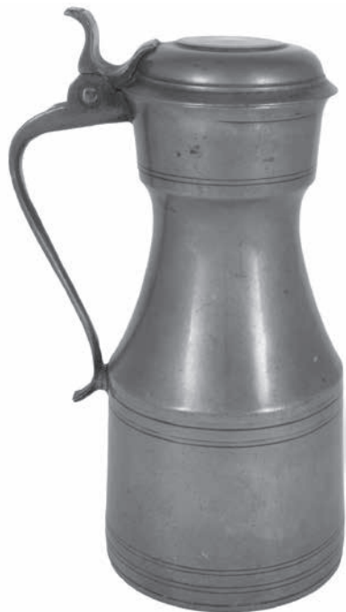
ILLUS 1 An 18th-century tappit hen

(Ingleby Wood 1904, plate XXII) dating to some time after 1669, when the maker became a master pewterer. It had never been subject to detailed examination and several interesting features had been overlooked. However, the recent discovery of three tappit hens from the wreck of the Swan , a small mid-17th-century warship, together with the recognition of four very early 18th-century examples, previously overlooked in private collections, enable us for the first time to piece together the early evolution of this eponymous Scottish measure.