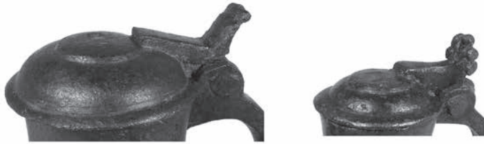
ILLUS 6 The heavy erect thumbpiece of the pint and the palmette thumbpiece of the half-mutchkin tappit hen (not to scale)

pewter, referred to as the ‘tapoun’, or more commonly, the ‘plouk’ (a Scots word for pimple). This indicated the level to which the measure was to be filled to hold its true capacity. The requirement for a tapoun was first mentioned in legislation passed by the Edinburgh Town Council on 31 January 1543 (ECA SL1/1/2). A further statute of 16 February 1554/5 (ECA SL1/1/2) is explicit: