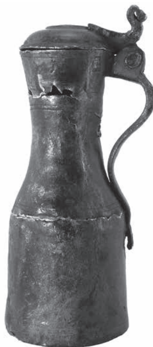
ILLUS 9 The chopin measure excavated from North Bridge, Edinburgh