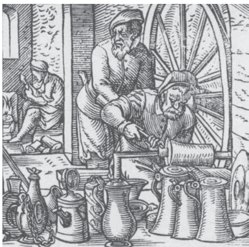
ILLUS 14 16th-century woodcut showing a pewterer finishing a flagon on a wheel lathe

base does not bear any mark. The hinge and thumbpiece are again both heavily cast. The thumbpiece is a palmette, but with the lobes less pronounced on the rear. One notable difference is that the attachment to the lid is now a thinner strap of metal that follows the contours of the dome of the lid. In this it anticipates the attachment seen in all later forms. The handle is of D-section.