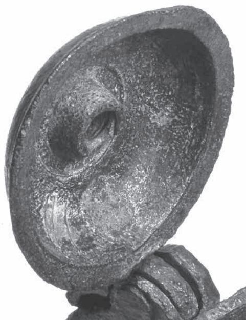
ILLUS 5 Inside of the lid of the pint measure to show the projection with screw threads

On the inside of the necks of the pint and chopin measures, to the left of the handle and just below the rim, is a blob of