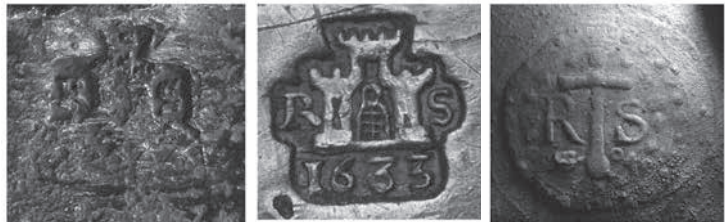
ILLUS 7 Left : Maker’s mark on the pint measure; centre : the mark as struck on the touchplate; right : the mark struck on the inside of the base

The dome-shaped lids are very heavily cast and bear in their centres a slightly raised disc, as on all later tappit hens. In the centre on the inside, they have a short projection, with coarse-cut threads on the inner surface (illus 5).