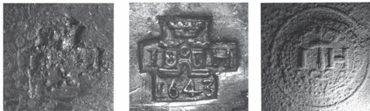
ILLUS 8 Left : Maker's mark on the chopin measure; centre : the mark as struck on the touchplate; right : the mark struck on the inside of the base

located to the left of the hinge, and directly behind the position of the plouk. The positioning of the mark dates back to 1554, when the statute of the Edinburgh Town Council referred to above, also called for, '... on the uter side of the tawpoun that the townis mark be thereon and makaris mark beside it' (ECA SL1/1/2).