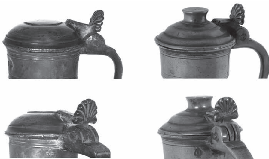
ILLUS 12 Side and rear views of the palmette thumbpieces of the Bute tappit hens