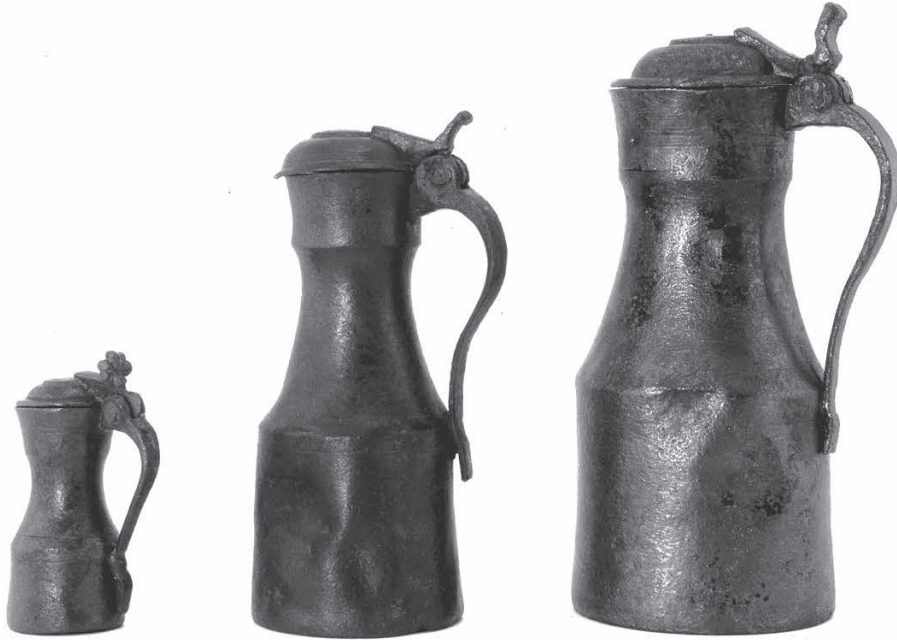
ILLUS 2 The three Swan tappit hens of half-mutchkin, chopin and Scots pint sizes

two other ships sank in a terrible storm on 13 September 1653, just a few metres off Duart Point. Her wreck was discovered by a naval diver in 1979, but the site was not properly excavated until 1992, when seabed disturbances put the wreck in danger of destruction. The subsequent excavation under Dr Colin Martin of University of St Andrews, uncovered a wealth of objects including cannon, the ship's binnacle, decorative carved woodwork and three tappit hen measures (Martin 1995: 15–32; Martin 1998: 46–66).