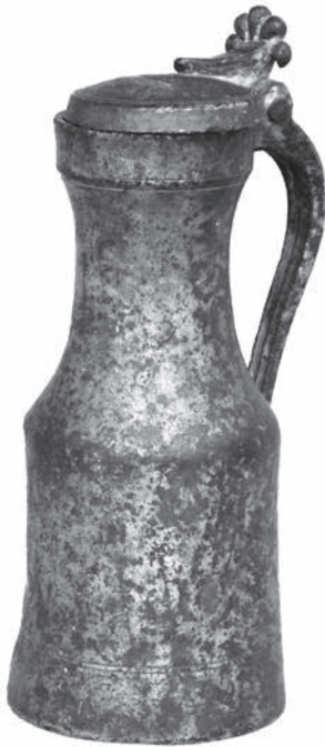
ILLUS 15 French flagon c 1600 from Rouen in Normandy

pewterers. In the 17th century, Edinburgh had extensive trade links, via the port of Leith, with northern European countries, but particularly with France and the Low Countries. Both of these countries appear to have influenced the form of the tappit hen measures. The body shape was very clearly derived from the north-west of France, from where extensive wine imports were made (Kay & Maclean 1983). Boucaud 4 notes that the ‘shouldered’ body form of early flagons and measures was peculiar to that part of France, and was not found elsewhere in Europe. The flagon from Rouen shown in illus 15 dates from c 1600, and the similarity of the body outline to the tappit hen form is immediately obvious.