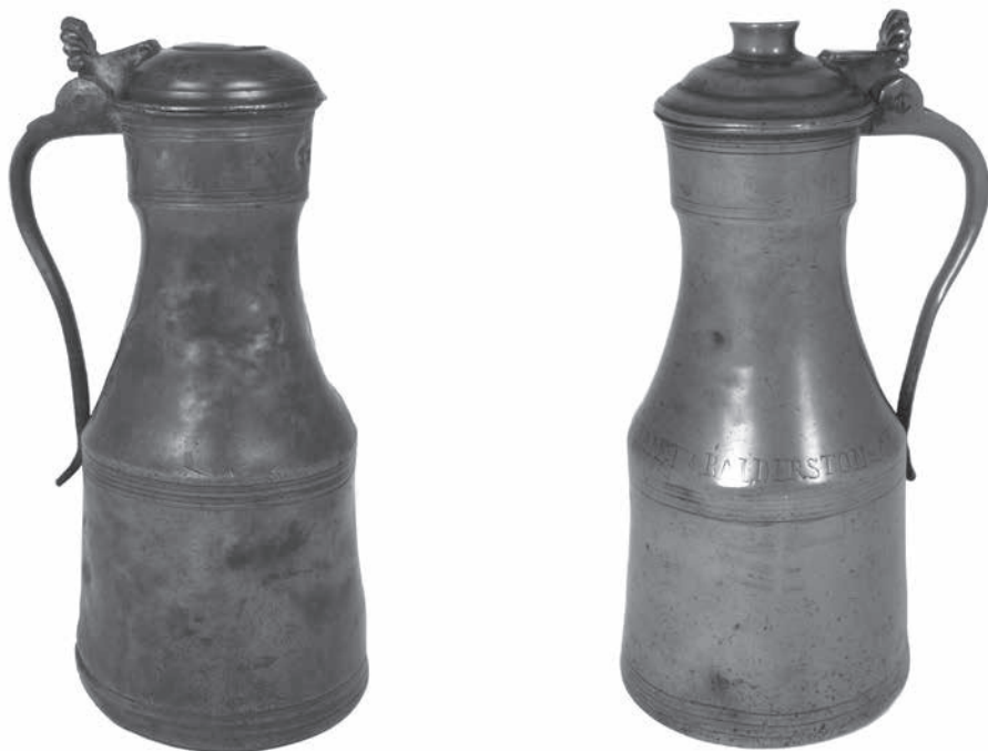
ILLUS 11 The two massive Bute tappit hens of Scots quart capacity