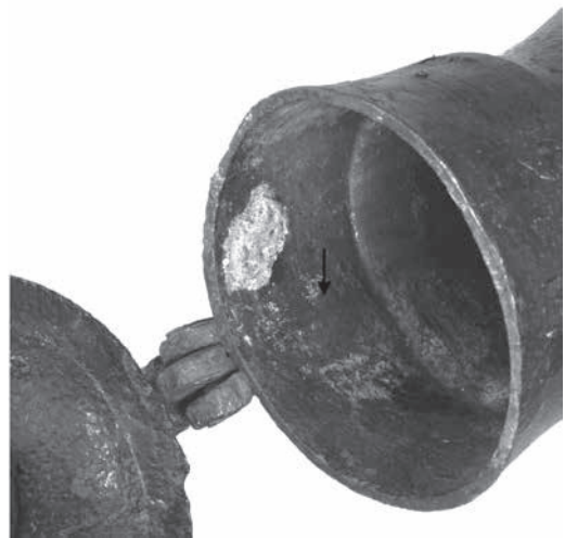
ILLUS 3 The vertical seam (arrowed)

recognisable tappit hen shape. The largest is a Scots pint, the second is a half-pint, or chopin, and the third is one-eighth of a pint, commonly referred to as a half-mutchkin