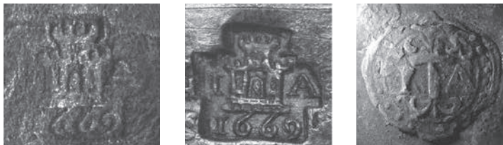
ILLUS 10 Left : Maker's mark on the Abernethie chopin measure; centre : the mark as struck on the touchplate; right : the mark struck on the inside of the base

The pint measure has the punched initials GW above RH on the lid, whilst the chopin is stamped C R and the half-mutchkin has the initials I K. In the 17th and 18th centuries it was common for domestic utensils to have ownership marks, probably to deter theft. Silver owned by the gentry was engraved with their arms. Pewter utensils more usually bore the owner's initials, either punched or engraved. The pint tappit hen has the initials of husband and wife, and this is something of a paradox in a warship. It seems likely that