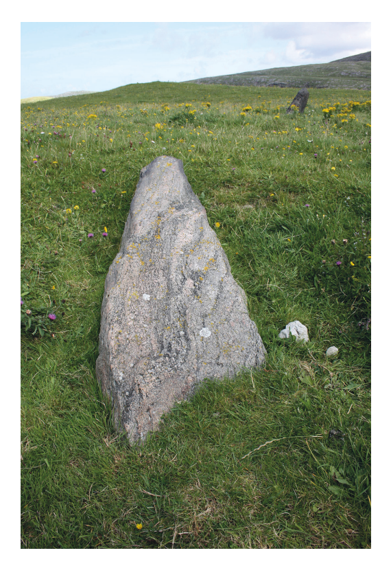
ILLUS 3 The two standing stones with the cairn in the background.

the promontory Stong Mòr (Harrison 2007: 175; OS 2007). As well as the standing stones themselves, the burial site is approximately 42m south of another pre-Viking Age man-made landscape feature, a cairn which is clearly visible from the site (illus 3) (OS 2007). Scandinavian burials in association with earlier man-made landscape features are not unknown in Scotland, and cairns in particular are associated with burials at Boiden (Loch Lomond), Swordle Bay (Ardnamurchan), Brough Road, Birsay (Orkney), Cnip (Isle of Lewis), and Tote (Isle of Skye) (Stewart 1853: 144; Lethbridge 1920: 135; Morris 1989: 288; Dunwell et al 1995: 720; Harrison 2007: 176, 178; Harris et al 2011: 19). Consequently, the cairn in the vicinity of the Ardvonrig standing stones has been considered a candidate for the burial site, but it is too distant from the stones to make this likely,