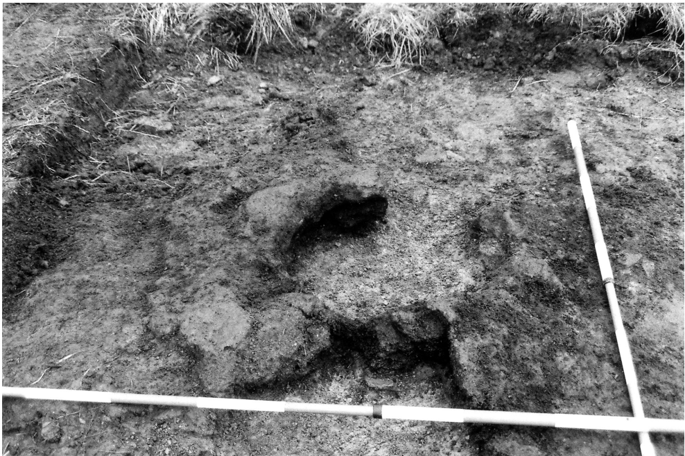
ILLUS 4 Post-excavation photograph of bloomery furnace from the south-east

In dating terms, Craggie sits within the known sequence for bloomery sites in late medieval Scotland. On the basis of current knowledge, bloomery furnaces date broadly from the 13th to 17th centuries (Atkinson 2003: 38). The two dates recovered from Craggie were statistically identical and seem to suggest that the furnace was only used for a short period of time between the late 15th and early 17th centuries. This evidence, together with the unusual scale and design of the furnace, its friable slag-rich walls and absence of