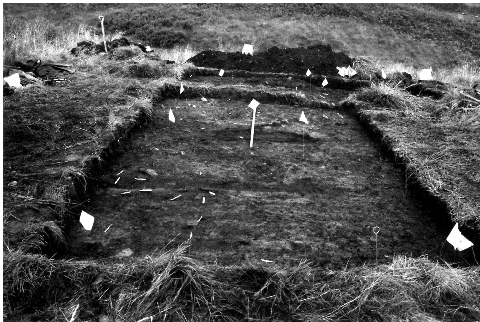
ILLUS 2 Post-excavation photograph of trench 2 (foreground) and trench 1 (background) from the south-west

mixed with slag and burnt clay from this feature. Birch ( Betula ) was also recovered from beneath the furnace bowl.