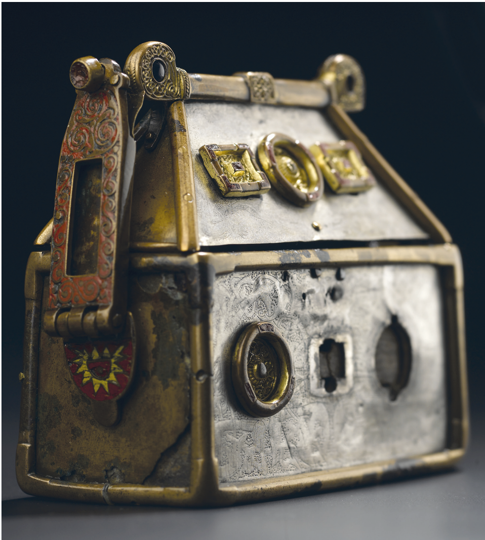
ILLUS 5 The Monymusk reliquary

ornate interlocking ridge on the HSS from Enger (ibid: Tafel 14). However, the fronts of these are decorated with geometric arrangements of multiple cabochons which in no way resemble the object in the Columba sketch. As far as the three-over-three arrangement of possibly circular mounts is concerned, a broad similarity can be seen in the front of the Ennabeuren HSS (ibid: Tafel 1), although this features stamped multiple roundels, displaying heads similar to Roman