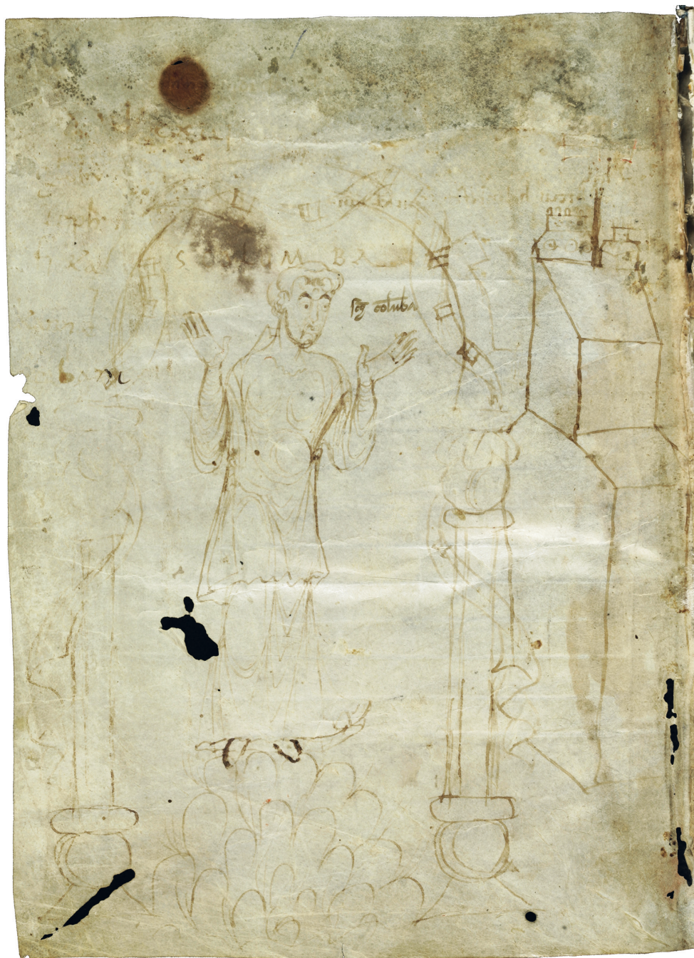
ILLUS 2 The image labelled as St Columba on the last page, page 166, of the St Gallen copy of Vita sancti Columbae created in the mid-9th century, Cod Sang 555