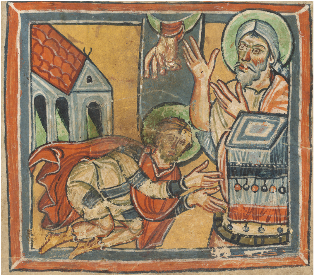
ILLUS 7 An altar shown in non-representational perspective, similar to the altar in the Columba portrait. St Gallen Psalter c 830.

the saint was considered to be simultaneously present in his relics as well as being in Heaven (Crook 2000: 17). It can therefore be suggested that amongst the treasures of the monastery was at least one HSS, bearing a similarity to the one of Insular origin that ended up in Bologna. There is mention in Cod Sang 339 p6, in an entry in a Calendar and Sacramentary dated to around 1100, that the abbey church of St Gallen possessed relics of Columba (Duft & Meyer 1954: 30). Were it true that the reliquaries shown in the image contained relics of the saint featured in this devotional image, it is certainly the case that the shrine is no longer to be found at St Gallen.