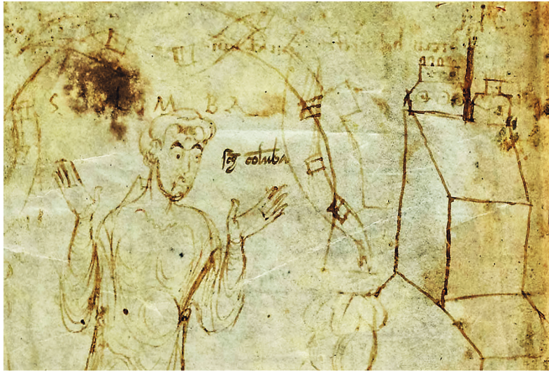
ILLUS 4 St Columba with the liturgical objects displayed on the lectern to his left (detail from Illus 2 enhanced by the author)

those tentatively identified at Iona Abbey from the excavated evidence of moulds and other metalworking debris (Campbell & Maldonado 2016: 90), their very act of creation being a form of religious devotion. They are usually interpreted as portable shrines, designed for carrying small pieces of a saint's bones in procession, or out into the community for the sanctification of laws and oaths (Caldwell 2001: 269). The precious materials used in making these boxes honoured and emphasised the sacred nature of their contents (Smith 2012: 156). Alternatively, a small casket like this could have served as a portable chrismal containing holy oil, or else as a pyx for the consecrated host brought to the sick and dying. Lacking any precise evidence of function, such as the inscription on the Anglo-Saxon casket from Mortain, France, which states that it was indeed a chrismal (O'Donoghue 2011: 86), it is otherwise impossible to be definite about function, and of course they may have had multiple uses over a long life. These complex composite objects were usually fabricated around the core of a wooden box covered with gilded metal plates, with applied metalwork decoration, and prominent gable finials joined by a roof ridge bar with inturned animal head terminals.