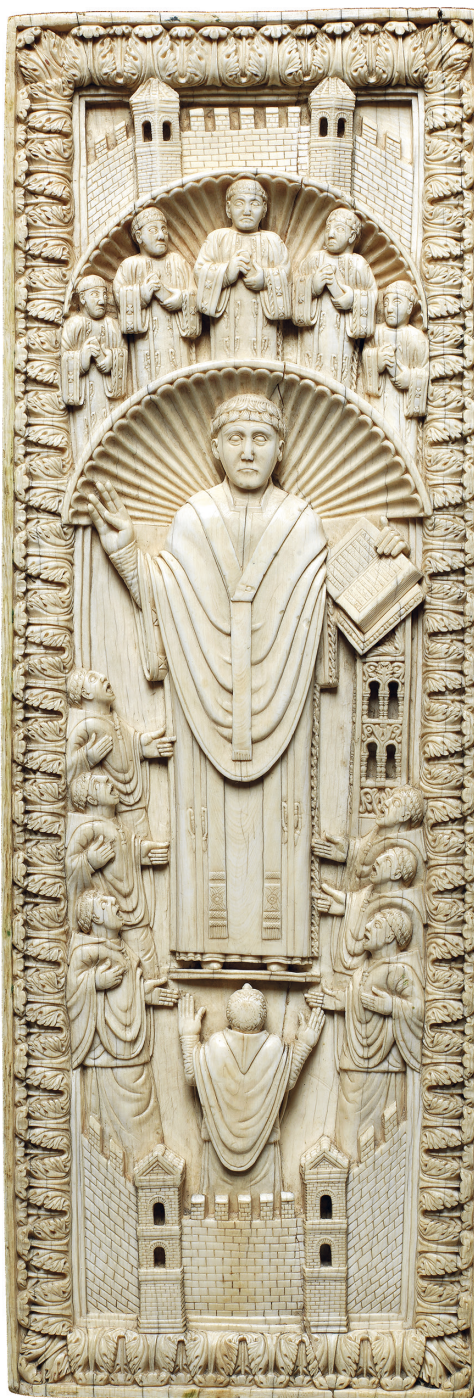
ILLUS 3 Ivory panel from a book cover, Carolingian 10th century, depicting a bishop about to celebrate Mass among his Choir. M 12-1904

To date there has been little discussion of this image, being simply described by von Euv (2009: 357–8) in the e-codices entry. The image was well-drawn in pen and black ink, now faded with some localised damage, filling most of the page which measures 1900mm × 1400mm. This may have been a sketch which was never fully worked up, and could even have been copied from another image (R Sharpe & R Gem pers comm). The saint stands central to and almost filling a round-headed arch, presumably representing a chancel arch or the arched entry to a side chapel. The arch is supported on a pair of polygonal columns, with rounded bases and capitals, all festooned with a fluttering fabric drape, like a ribbon, wound loosely around and uniting the arch and columns. The foliage forms carved on the capitals could be the artist's take on the acanthus leaf motifs commonly found on Carolingian capitals.