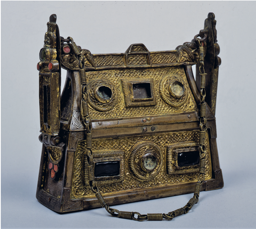
ILLUS 6 The Bologna house-shaped shrine

emperors, rather than applied mounts common to the Insular examples.