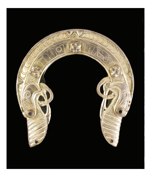
ILLUS 2 The inscribed chape: obverse.

epigraphic. Virtually all the surviving names in Shetland post-date the arrival of Norse-speakers who had an effect like onomastic napalm and all but entirely obliterated the earlier linguistic layers. Three possible exceptions are the island names, Unst, Yell and Fetlar. Certainly, these are not transparently Norse and are hard to explain. As a consequence, they have been held up as evidence of a non-Celtic, non-Indo-European language having been spoken in Shetland before the arrival of the Norse (Nicolaisen 2003: 141-2). Detailed new analysis by Coates, however, suggests that Fetlar may well be Scandinavian after all (Coats 2019), and Yell (Iali, Iala, c 1300) is likely Brittonic, deriving from the Celtic *ialo- 'unfruitful/late-bearing land', seen in numerous French place-names of Gaulish origin (for example, Auteuil, Ebreuil) and in the Welsh place-name: Iâl, Denbighshire (English Yale) (Sims-Williams 2005). This convincing derivation would seem entirely appropriate to 'da wilds o'Yell' (Coates 2007). The linguistically opaque island name Unst remains unexplained. It may, like Yell and Fetlar, eventually yield to an