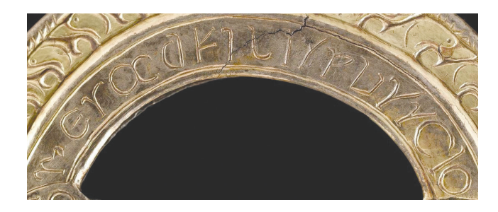
ILLUS 5 Detail of the inscription: reverse.