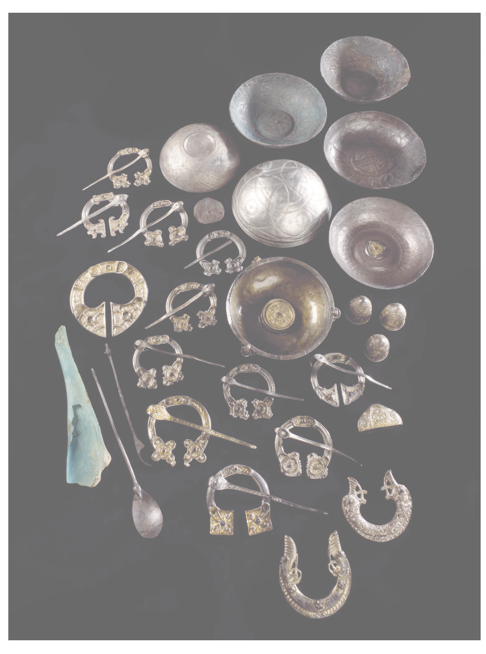
ILLUS 1 The St Ninian's Isle hoard (inscribed chape at bottom of picture).