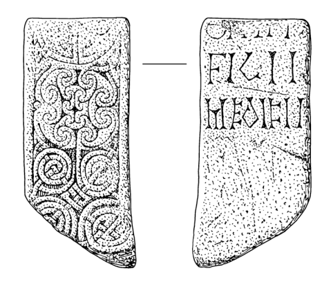
ILLUS 7 M as three separate strokes: Medicii , cross-slab from Lethnot, Angus (detail). (© RCAHMS/ HES; Canmore SC 1359712)

The second failing identified by Brown is the 'marked reduction of o' which he rationalised as 'presumably to save space' (1959: 250). In fact, small o is also a feature of Insular display script, where it is used for purely visual effect, as, for instance, on the 7th-century Peter Stone from Whithorn (Forsyth 2005: 127-9), as noted by Jackson (1973: n 172) (Illus 8). A third feature which jarred, in Brown's view, was the bold serif at the end of the crossbar of e, 'where formal majuscule allowed a square or triangular serif' (Brown, T J 1959: 250). Yet, surely, this is simply a design flourish embellishing a word ending. Jackson provides epigraphic examples of similar letters (1973: 172), including the probably 8th-century inscribed stone from Llanllwni, Carmarthenshire (Nash-Williams 1950 no. 164; Edwards 2007: 259 = CM30). Brown was also unhappy with the 'extravagance of the hook representing the wedge in s' (1959 251). Note his assumption (misplaced) that the hook should