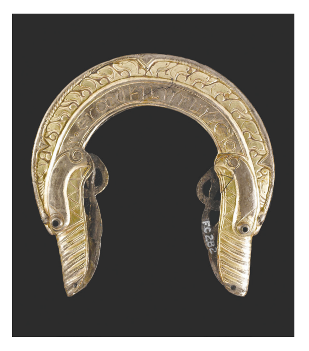
ILLUS 3 The inscribed chape: reverse.

26-8). There is also one portable item which may be ogham-inscribed. This is a small stone disc, c 65mm in diameter, possibly a gaming piece, from Bigton - the nearest settlement to St Ninian's Isle on the adjacent mainland of Shetland - which is incised on both its upper and lower surfaces as well as its circumference with a variety of different carvings. A drawing of it is included in Scott & Ritchie 2009 (17, no. 28) but it is otherwise unpublished. The carvings include a sequence of at least six short, roughly parallel, irregularly grouped lines which have the air of ogham letters. Poor preservation makes them difficult to discern and the reading remains in doubt. As linguistic testimony they must be set aside for now, as must the small fragment from Whiteness and the three fragments from Mail, Cunningsburgh, which preserve only snatches of text that are too short for meaningful interpretation.