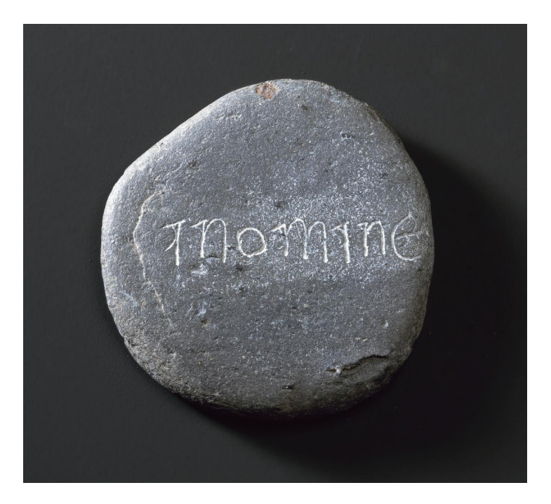
ILLUS 10 Bookhand reproduced in stone: Dunadd pebble (showing imitation of wedged serifs and two-stroke O ).

only tablets known to survive from the period, there is textual and other evidence to indicate that the tradition of tablet-writing continued in early medieval Britain and Ireland for material which was too informal, ephemeral or private to merit the expense and effort of committing it to a vellum manuscript (Brown, M 1994). Charles-Edwards has contrasted the writing techniques which were in use on these different materials: 'that of the developing scribal craft, with its contrast between the careful thick and thin strokes of the broadedged pen, and the more workaday linear letterforms of the stylus' (2007a: 79). What is perhaps surprising is that the latter appears so widely in monumental form,<sup>2</sup> 'presumably practiced by mason craftsmen who were familiar with styluswriting, but not with penned lettering, and who transferred to stone, enlarged, and with brushes, the curved entry strokes' (ibid). The painted origin of such epigraphic lettering is sometimes betrayed by a distinctive blob at the entries. Because a point, rather than a flat-tipped nib, was employed for stylus-writing, the letters are