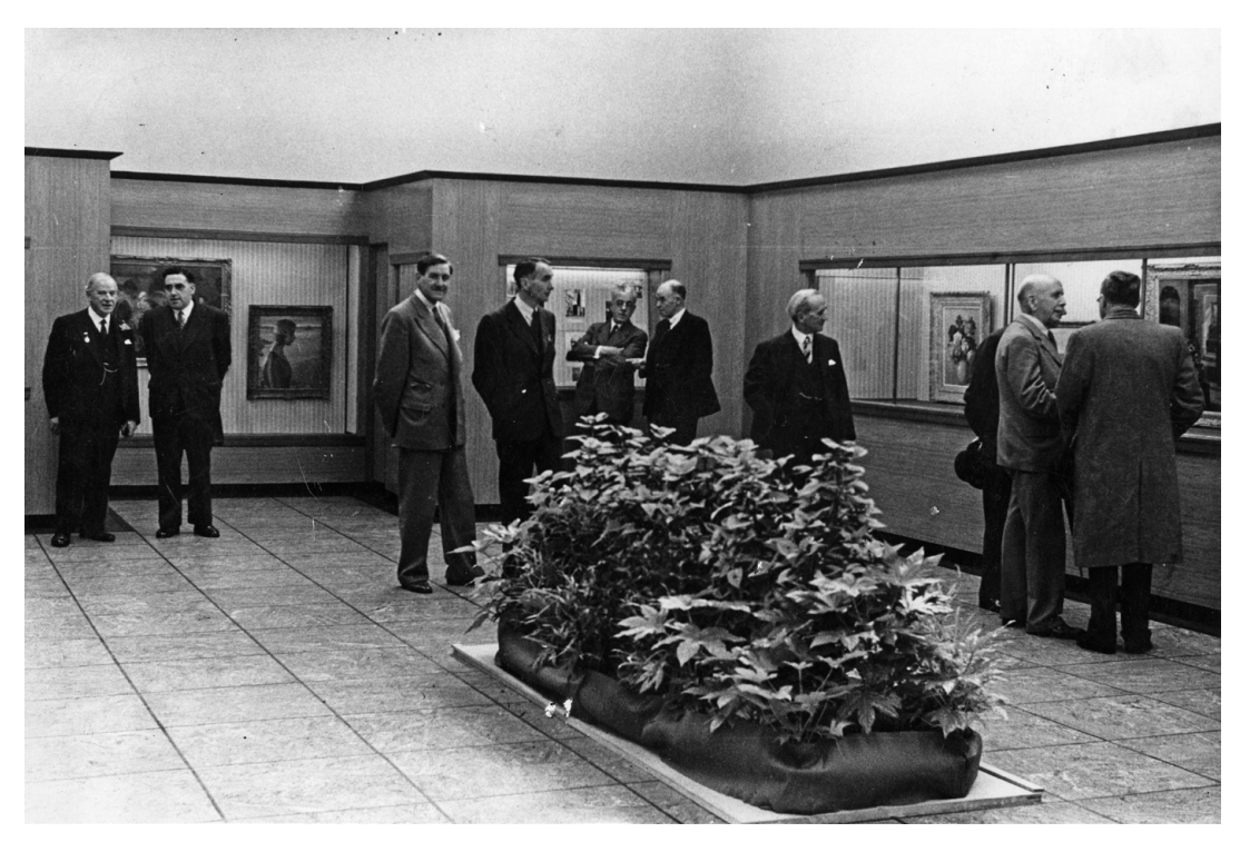
ILLUS 5 An exhibition of paintings in the main gallery of Airdrie Library Museum shortly after its refurbishment in 1953.

the post-war years. However, in Airdrie, the impetus provided by funding for revamped premises seems to have consolidated this streamlined and community-focused approach. In direct contrast to the eager accumulation which characterised the early years of the museum, most of its collections were now surplus to the requirements of the displays. In this context it is not surprising that the identities of the collections from Cyprus and Egypt became detached from the objects themselves. As Stevenson (2019: 194) comments, this is a common experience of such collections: 'In the absence of formal documentation, and with the death of previous generations of curators ... many objects [are] rendered mute.' The museum never returned to the proliferation of its earliest displays, though parts of the collection moved in and out of storage. Following the optimism of the 1950s, it entered a period of decline, eventually closing to the public in 1974.28 Ownership of the