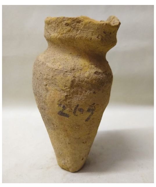
ILLUS 2 Egyptian pottery vessel marked '269' from John Garstang's excavations at Beni Hasan.

Pitt Rivers collection, and Derby Museum and Art Gallery (Reeve 2020a). There are similarities between the objects in Derby, in particular, and those in the surviving North Lanarkshire Council Museums collection, such as a transport amphora and Hellenistic plain wares (Reeve 2020b). The Derby collection also includes modern Cypriot pottery, which was an interest of Esmé Scott-Stevenson's, and this may explain the presence in the North Lanarkshire collection of similar relatively modern objects. This collection forms a small part of the wider diaspora of Cypriot antiquities in the UK, with highly varied histories of excavation, collection and display (Kiely & Ulbrich 2012; Nikolaou 2013).