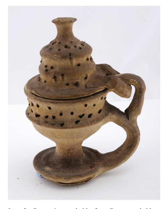
ILLUS 3 Pottery incense holder from Cyprus, probably 19th century.

history specimens, and these 'Phoenician' antiquities. Hunter Selkirk was extensively honoured for this donation, with the freedom of the Burgh, the role of opening the new museum in 1895, a commemorative marble plaque in the museum, and a grand celebratory dinner. The competition between museums, and the status that accrued from having extensive and rare collections, is evident in the speeches given on this occasion: the objects were valued not only for their intrinsic merit, but specifically because they were 'superior' to those owned by other museums. 9 As Knell (2007: 265) notes, 'honour and patronage ... became the currency with which to win or buy favours, and through which the collections would grow'. Hunter Selkirk had promised Dr Andrew Selkirk that 'by way of acknowledgement ... the result of their joint labours [would be called] the Braidwood Collection'. 10 However, at the point of this donation there was no acknowledgement of Andrew Selkirk's contribution, and honour was bestowed on Hunter Selkirk alone