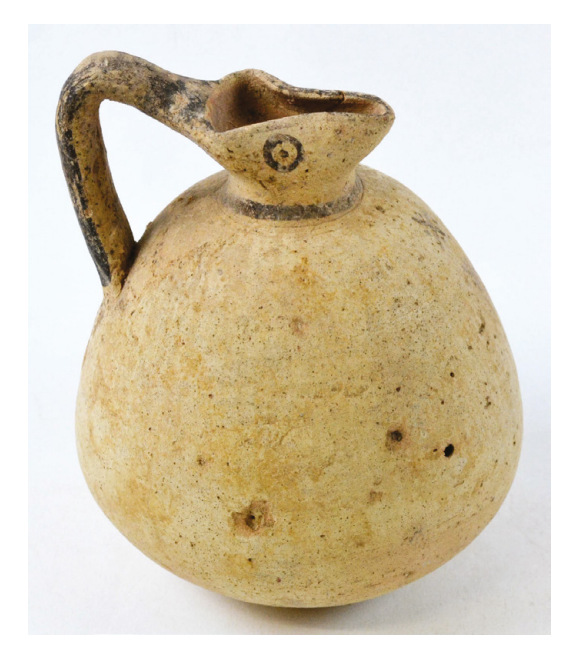
ILLUS 1 White Painted jug from Cyprus, Cypro-Archaic period, c 750–600 BC.