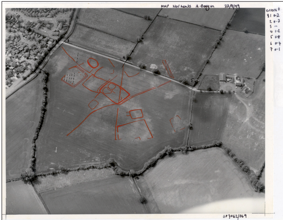
Figure 10. The Archaeological features and control points traced onto acetate film attached to the photograph (NCC Photo Index 7062/069).