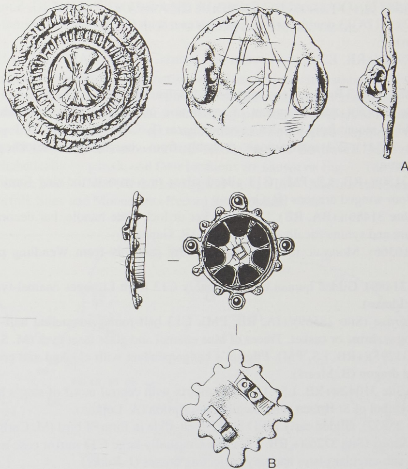
Fig. 4 Late Saxon finds A: Brooch from Lopham. B: Brooch from Quidenham. Scale 1:1

cross motif and pellets, the other with lozenges forming cross motif (S. Brown). Walton, W. (Site 18947)(+MS, MED). Shield-shaped hooked tag. Winchester-style strap-end (M. Carlile).