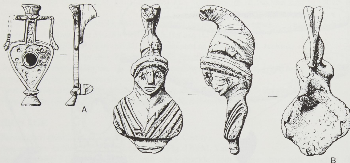
Fig. 3 Roman finds A: Brooch from Gayton. B: Vessel mount from Mileham. Scale 1:1