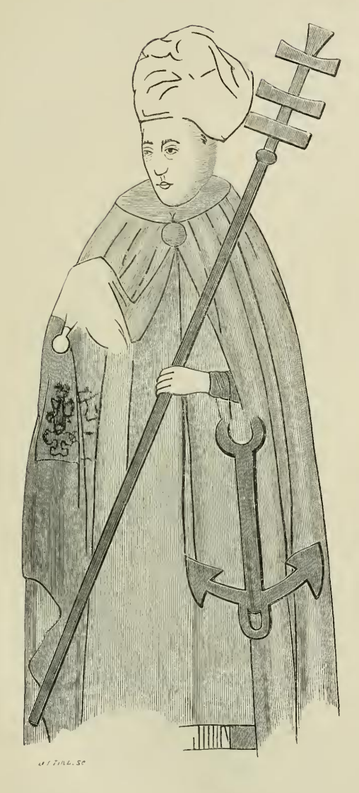
MURAL PAINTINGS FORMERLY EXISTING IN LINGFIELD CHURCH.