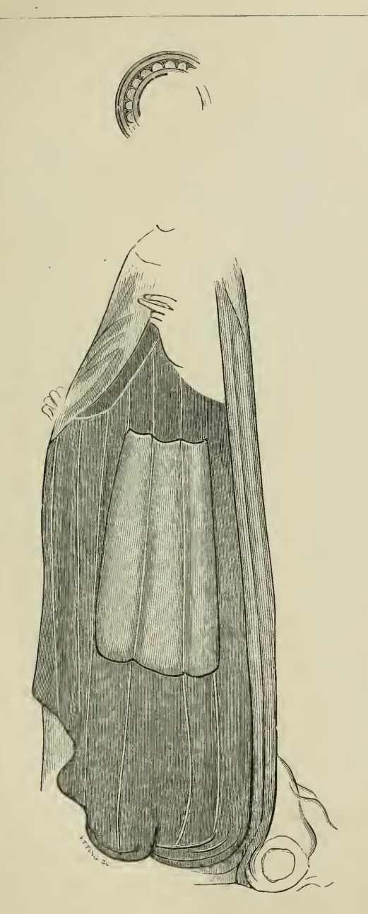
MURAL PAINTINGS FORMERLY EXISTING IN LINGFIELD CHURCH.