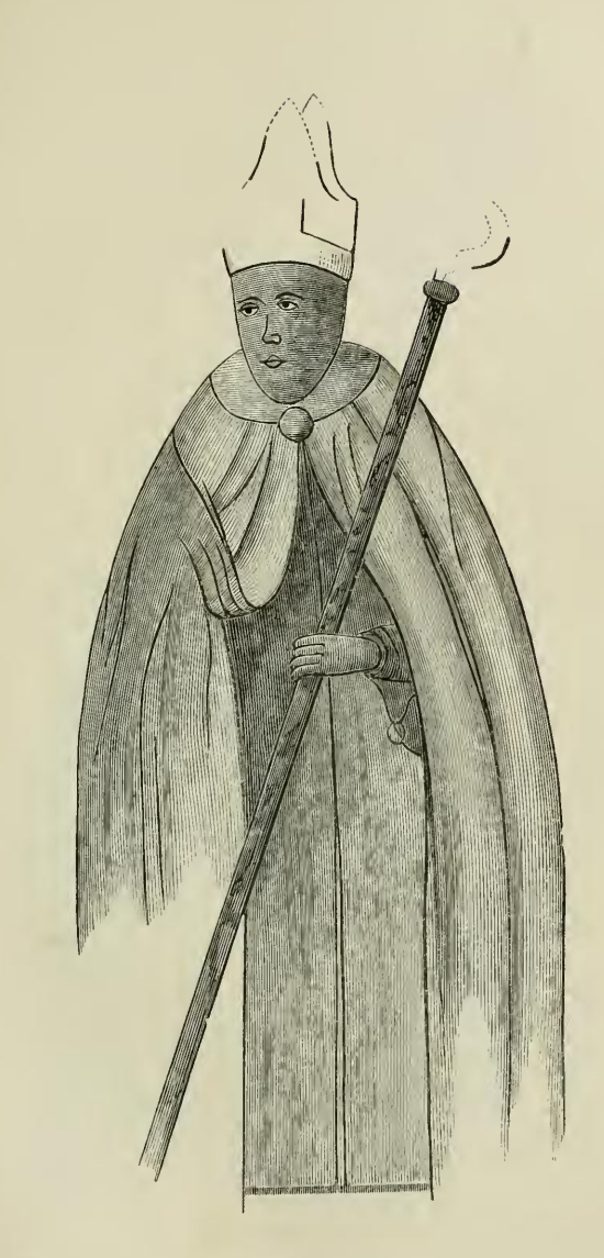
MURAL PAINTINGS FORMERLY EXISTING IN LINGFIELD CHURCH.