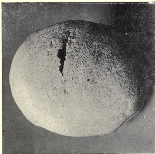
ANCIENT BRITISH SKULL. Merrow Down.