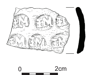
Fig 2 Baynards Park Estate, Ewhurst. Sherd of earthenware pottery jar with multiple impressed stamps bearing initials IM.

A number of Victorian internal wall foundations were identified, but no traces of 16th century masonry were found. Around the edge of the building, a deposit of crushed red brick and tile clearly defined the western extent of the Victorian house. No evidence for any medieval occupation at the site was identified.