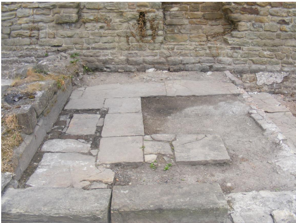
Plate 4 Trench 21 overview.