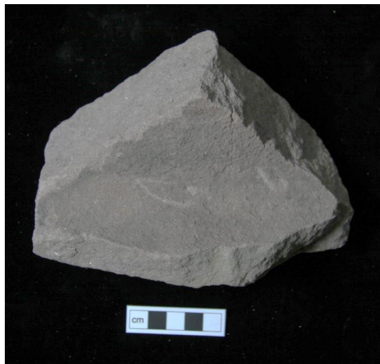
Plate 31. Worked sandstone from (21015)