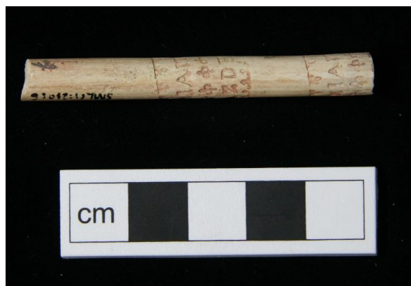
Plate 32. Decorated pipe stem from (21016)