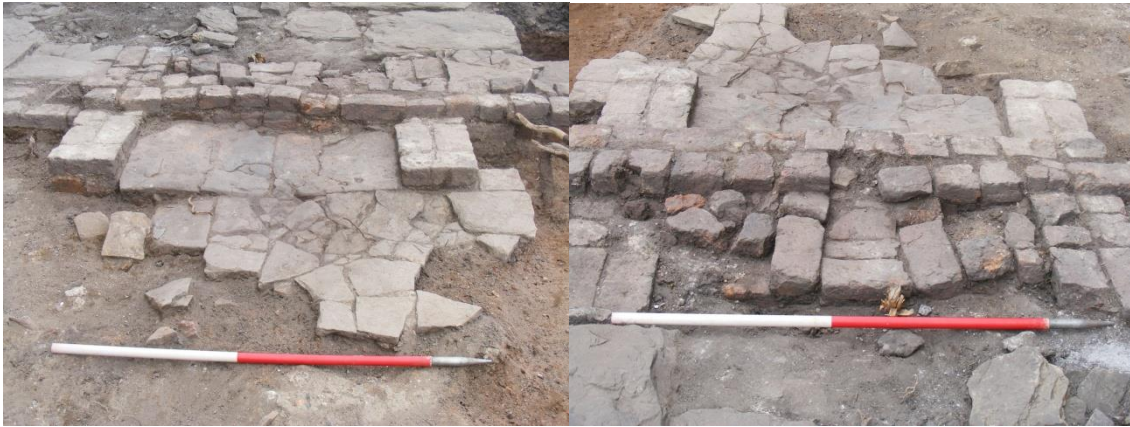
Plate 11. Fireplaces in Trench 22. Left: fireplace in main trench (facing north), formed by brick projections 22002 and 22003 with central flagstone 22026. Right: fireplace in extension (facing south), 22008.