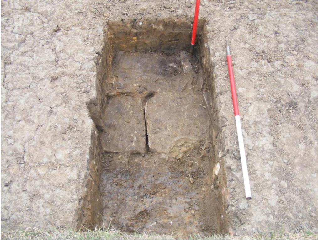
Plate 15. Section through upper fill (20038) of drain 20039, excavated to the level of stone slabs 20040 (facing west).