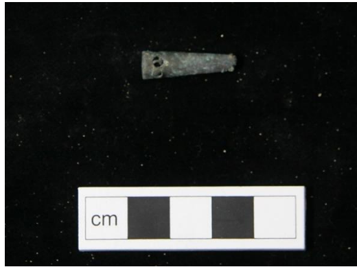
Plate 21. Conical copper-alloy object from (19006)