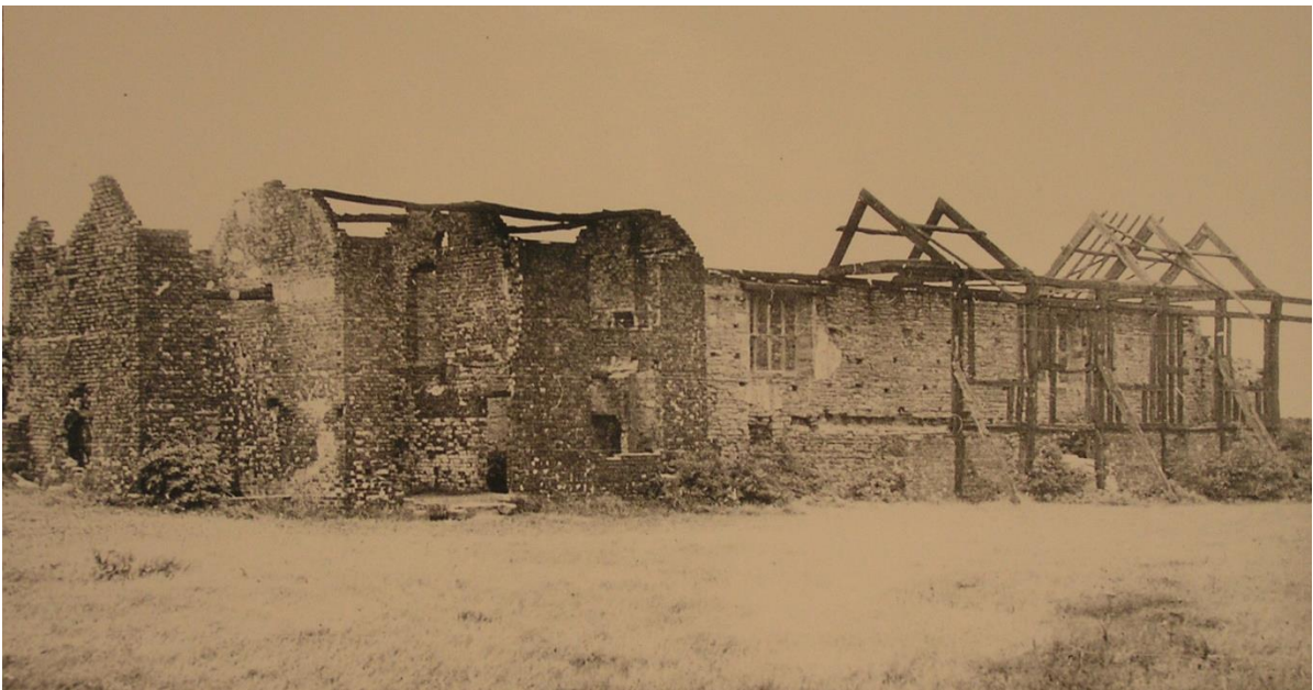
Plate 6. Photograph of partially demolished cottages in the Long Gallery (c.1930); internal features can just be seen inside the brick cottages at the southern end of the Gallery, including fireplaces on the upper storeys.