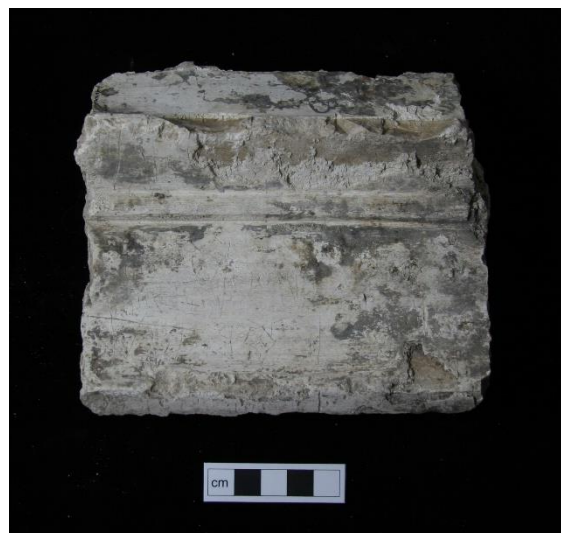
Plate 20. Moulded plaster from (19001)