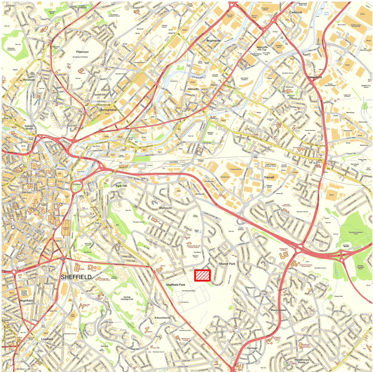
Figure 1. Site location