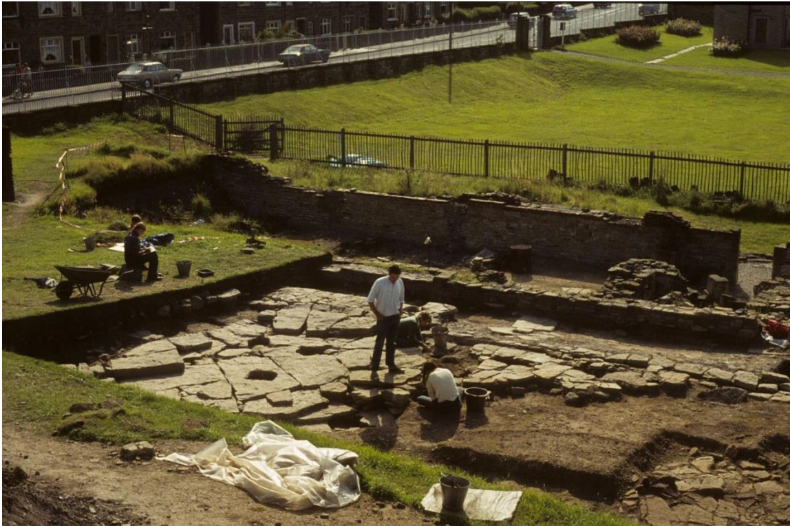
Plate 19. Sheffield City Museums excavations underway in 1980; a fence, to which pits 20012 and 20044 probably belonged, can be seen in the background dividing the Outer and Inner Court areas.