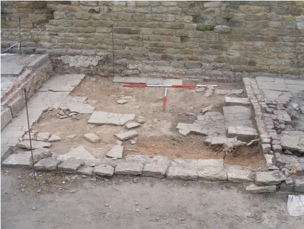
Plate 9. Trench 22 overview, facing west; wall 22027 is towards the front of the photo, with flagstones 22017 and 22018 visible in the trench and brick wall 22004 on the right of the photograph.