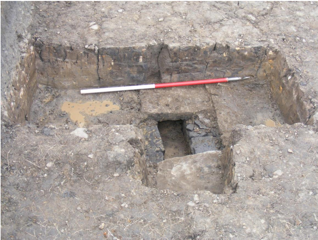
Plate 16. Section through upper fill (20038) and stone slabs (20040) of drain to reveal channel (20041) below, facing south.