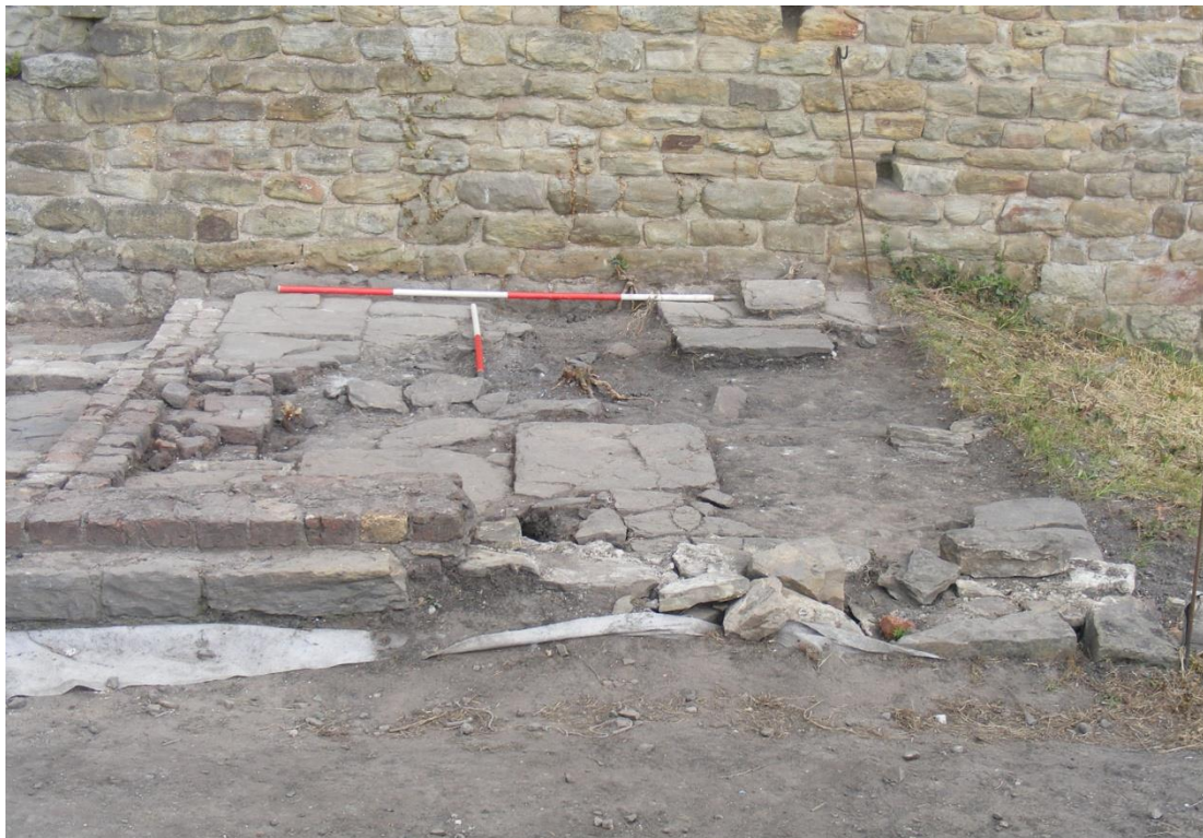
Plate 10. Trench 22 northern extension, facing west.