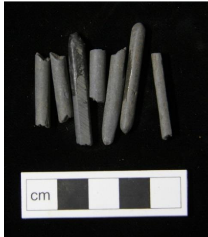
Plate 28. Styli from (20009)