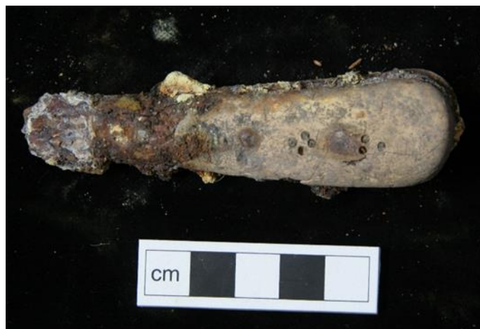
Plate 26. Composite bone and iron knife handle from (19006)