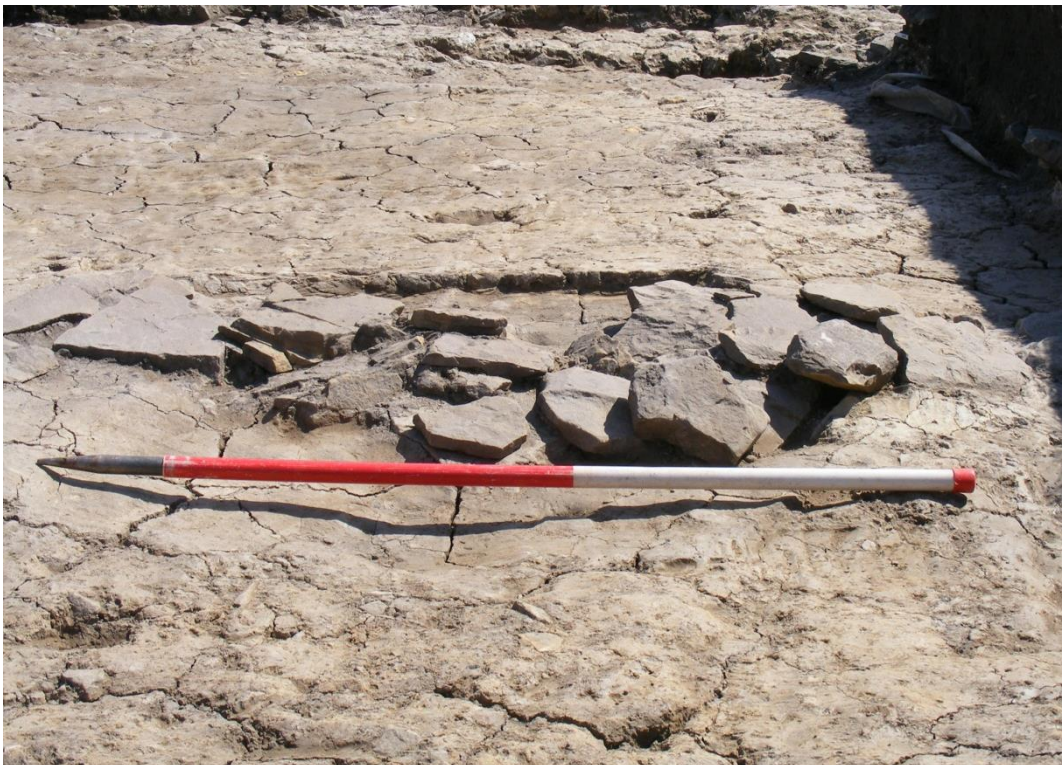
Plate 14. Shallow feature of flat stones 20032, facing west.