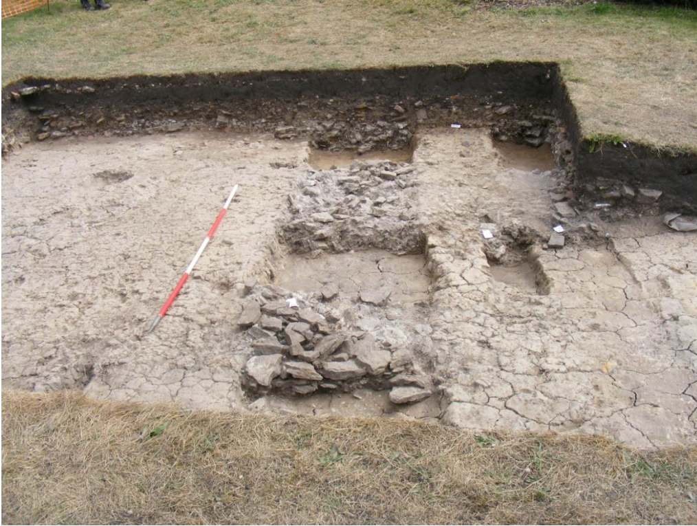
Plate 13. Wall foundation trench 20019 during excavation, facing south; gullies 20021, 20027 and 20037, also partially excavated, lie to the west.