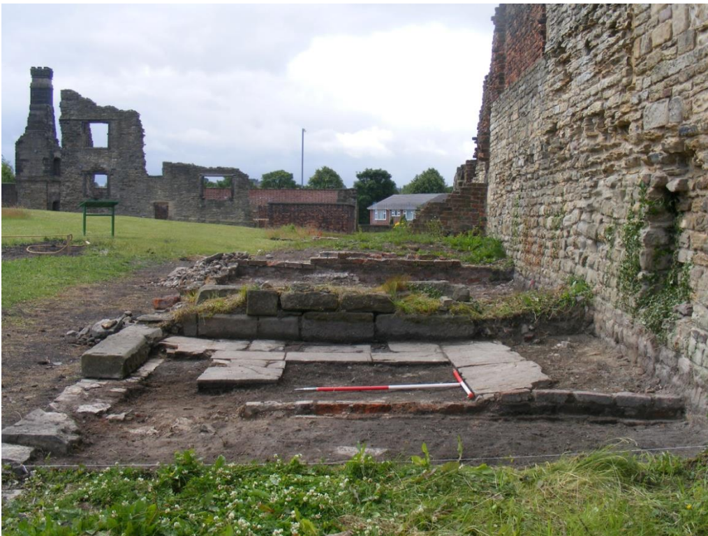
Plate 8. Trench 21, facing south; in the foreground brick wall 21006 projects from the Long Gallery wall to the right of the picture; flagstone floor 21004 can be seen beyond that.