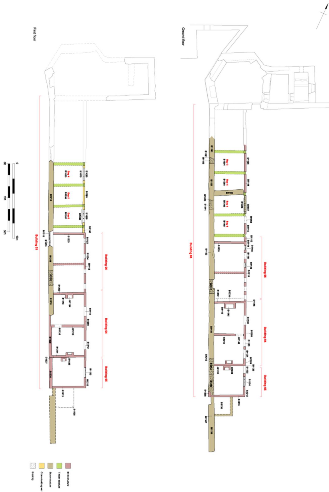
Figure 4 Reconstruction of the 19th-century phase of the Long Gallery at ground floor and first floor level (after University of Sheffield and Wessex Archaeology 2011, fig. 10)