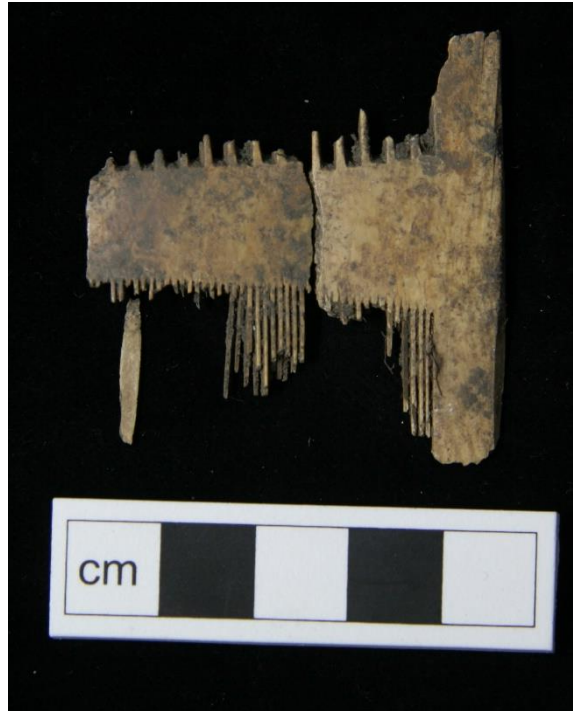
Plate 33. Bone comb from (22010)