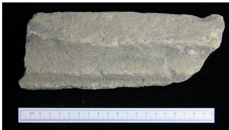
Plate 23. Masonry fragment from (19006)