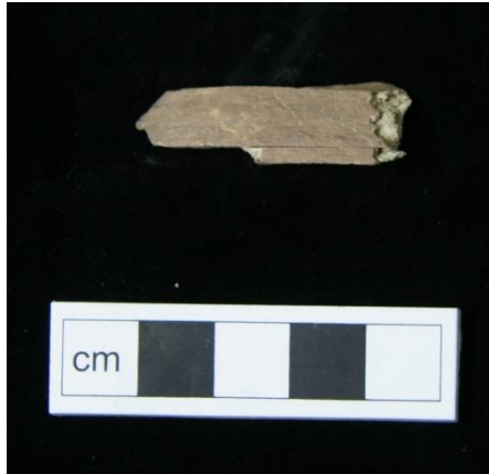
Plate 27. Worked bone fragment from (20009)