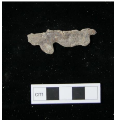
Plate 22. Unidentified lead object from (19006)