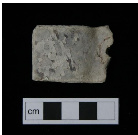
Plate 29. Lead strip with perforation from (20017)