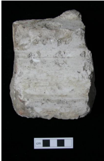
Plate 25. Moulded plaster fragment from (19008)