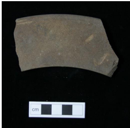
Plate 34. Grinding stone from (22010)