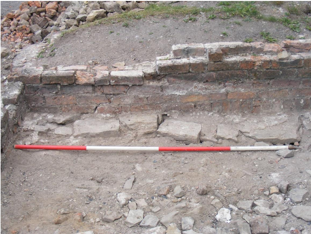
Plate 2. Possible stone drain cover 19009 in Trench 19.