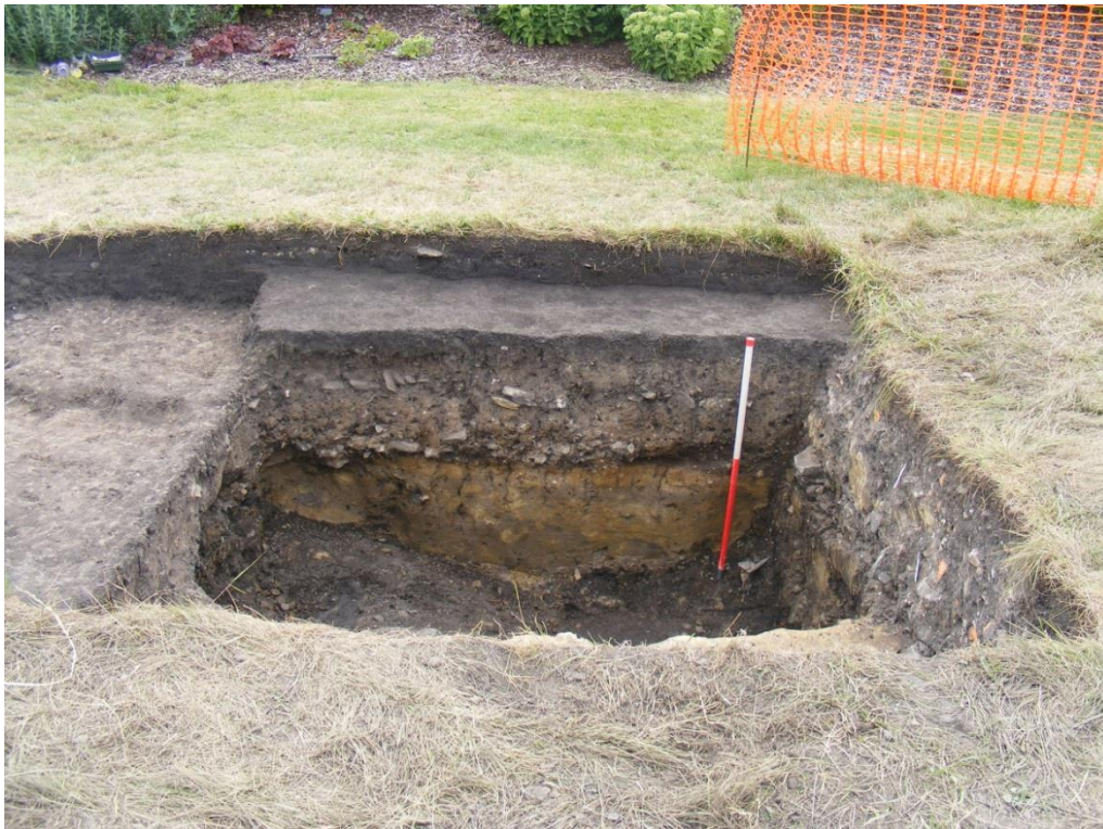
Plate 18. Backfilled trench excavated by Sheffield City Museum in the mid-1970s and revealed at the western end of Trench 20.