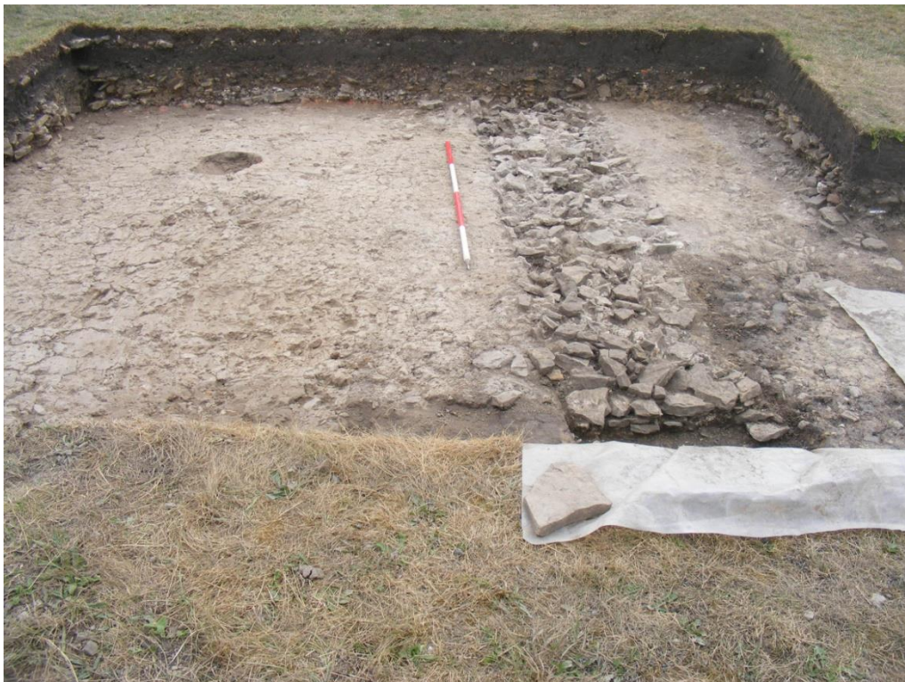
Plate 12. Trench 20 wall foundation trench 20019 (filled by 20018), facing south; the base of circular pit 20044 can be seen to the east.