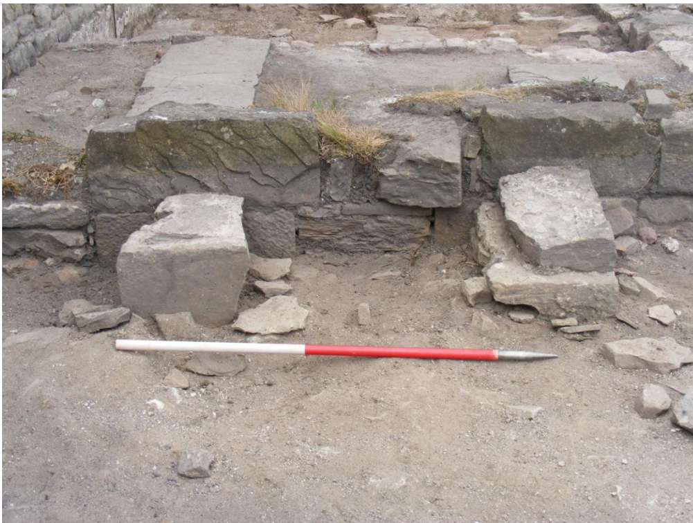
Plate 3. Fireplace in Trench 19, formed by 19002 (left) and 19003 (right); possibly a disturbed feature as the fireplaces elsewhere in the Long Gallery were of red brick.