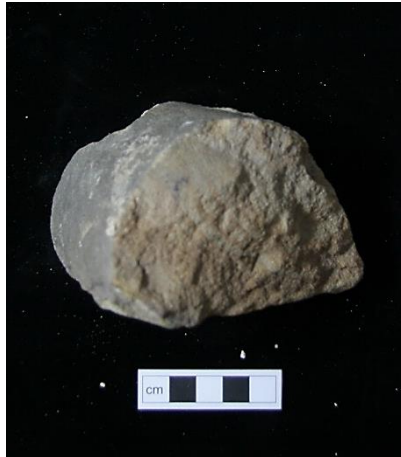
Plate 24. Sandstone masonry fragment from (19007)