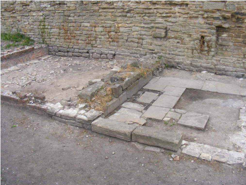
Plate 5 Trench 19 (left) and Trench 21 (right) separated by stone wall 21020.