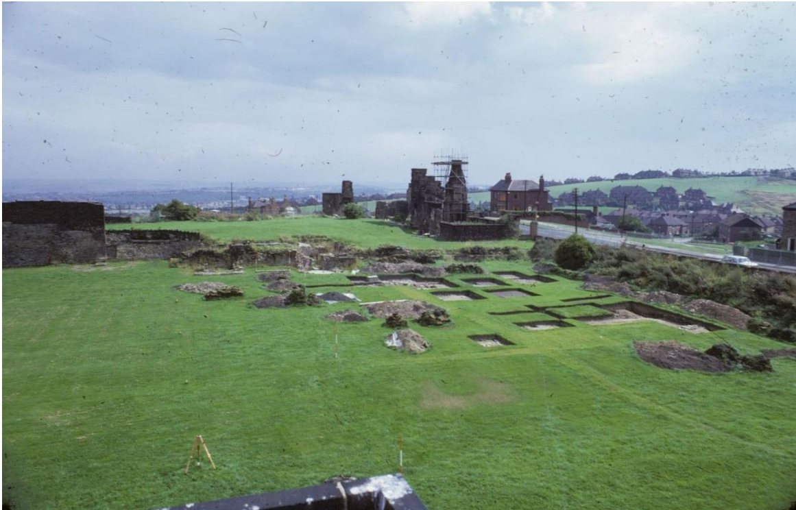
Plate 17. Grid trenches in the outer Court in 1974.