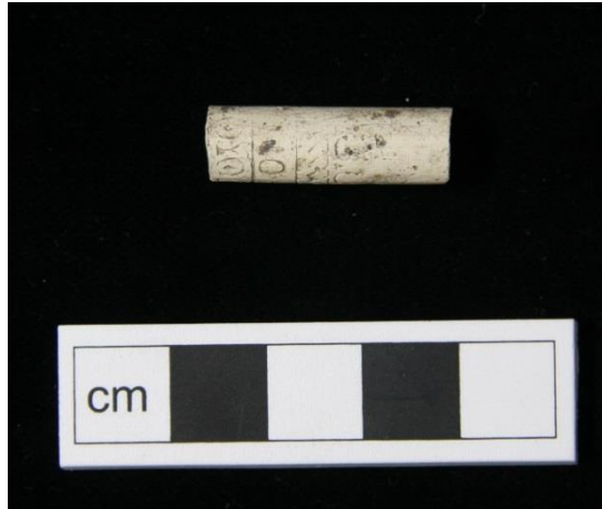
Plate 30. Decorated clay pipe stem from (21007)