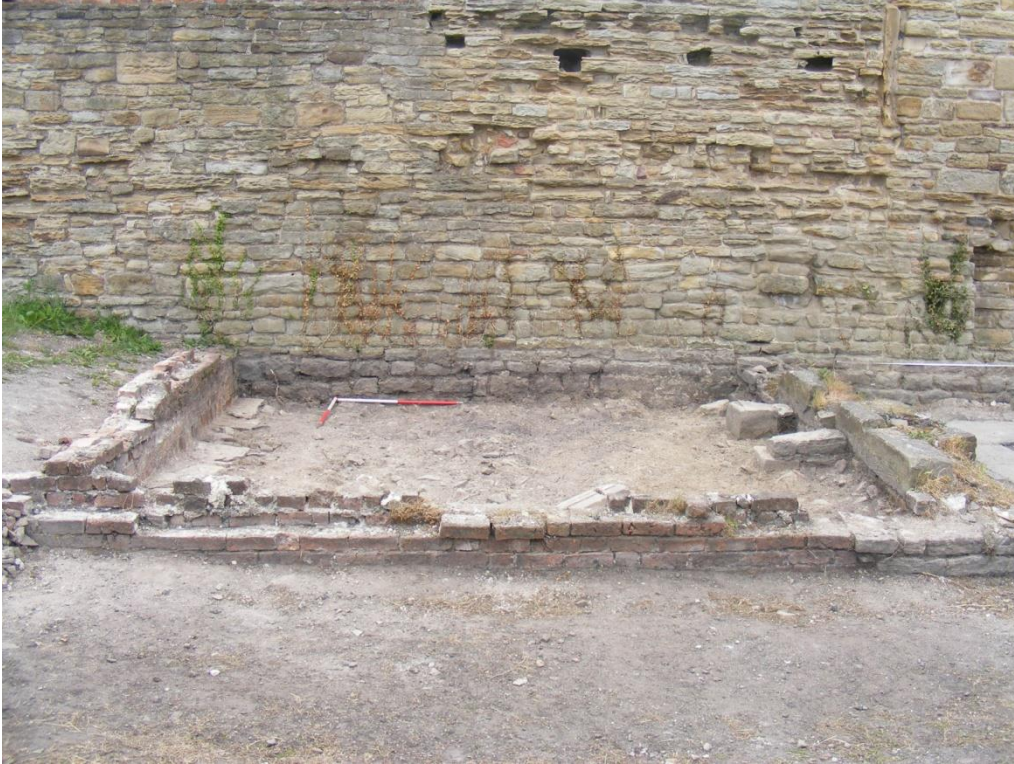
Plate 1. Brick walls marking the eastern (19010; left) and southern (19011; front) limits of a cottage in Trench 19, with a stone wall (21020; right) dividing it from the adjacent cottage.