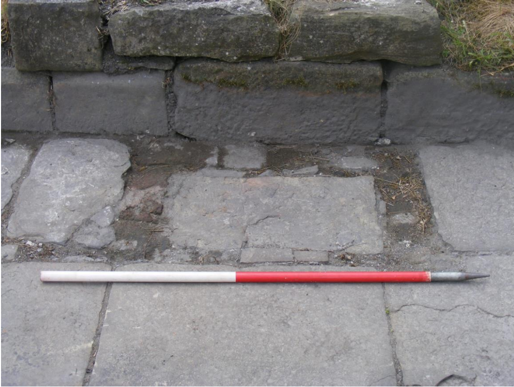
Plate 7. Fireplace in Trench 21 formed by 21009 and 21011.