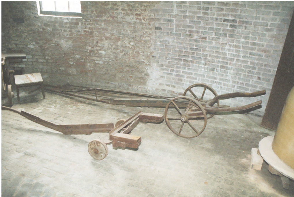
Figure 3.15: Pot changing forks (Red House Cone)

Reference to the bogie may be found in Part 2, 1982. The original sketches are difficult to interpret, so only a simple outline has been attempted in Figure 3.14. [There also appears to be iron braces to the axles and a shaped iron plate fixed to a transverse bar, of unknown purpose. The original bogie is in store at the North Somerset Museum at Weston-super-Mare, but has not been seen.]