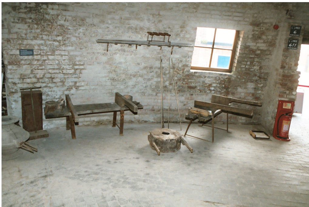
Figure 3.16: Glass blowers' chairs (Red House Cone)

The above pictures, Figures 3.15 and 3.16, speak for themselves.