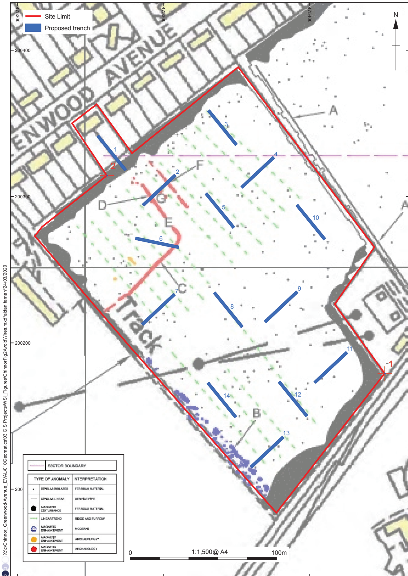
Figure 2: Trench locations