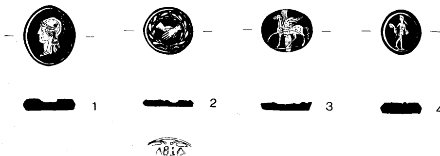
Fig. 1 Eastcheap Intaglios: The Intaglios (†).

Device Bust of Roma wearing an Attic helmet in profile to the left.