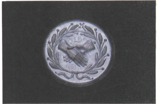
Plate. 1 Eastcheap Gems: Intaglios from Eastcheap.