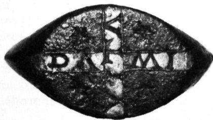
Plate 1. DA MI VITA ring.