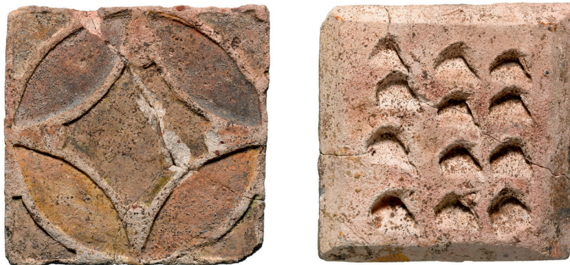
Fig 1. Late Saxon polychrome relief floor tile from Gresham Street showing decoration and keyed back (scale 1:3)

Despite the tile's poor quality, wear marks on the raised ribs separating the different coloured glazes indicate the tile was laid horizontally as flooring. The same, or at least a very similar design, is present on the Saxon tiles from Winchester (Backhouse et al 1984,