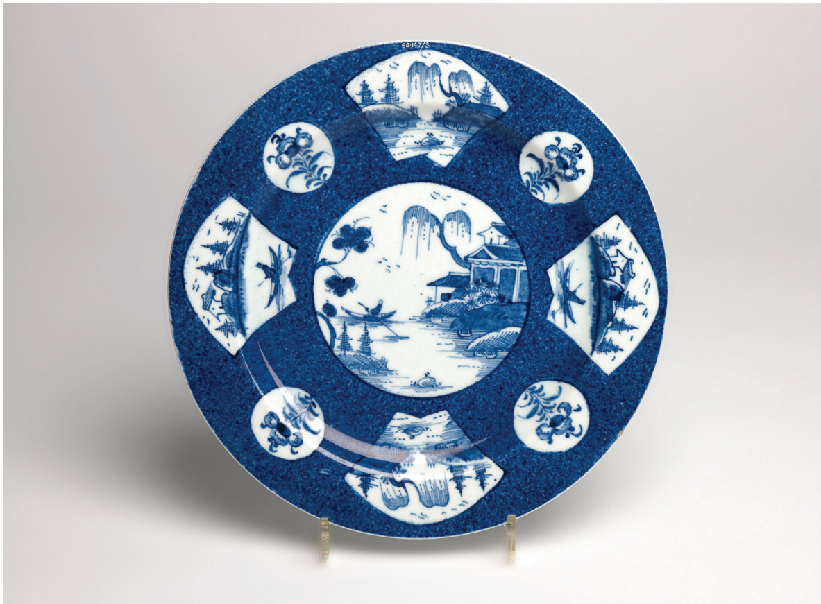
Fig 1. Plate in Bow porcelain, c.1760, diameter 206mm (accession no. 68.147/3)

One other porcelain works was located in Middlesex, at Isleworth. The Pottery was founded in 1756 by Joseph Shore, on the east side of Railshead Creek, making slipware, creamware and other fabrics. They also made porcelain from 1756/7 until 1787, although it is only recently that the factory's products have been recognised through the work of Ray Howard, collecting wasters from the foreshore close to the site of the pothouse. Excavations in 2002 in Hanworth Road, Hounslow revealed massive quantities of Isleworth porcelain wasters, deliberately dumped in quarry pits on a site that had