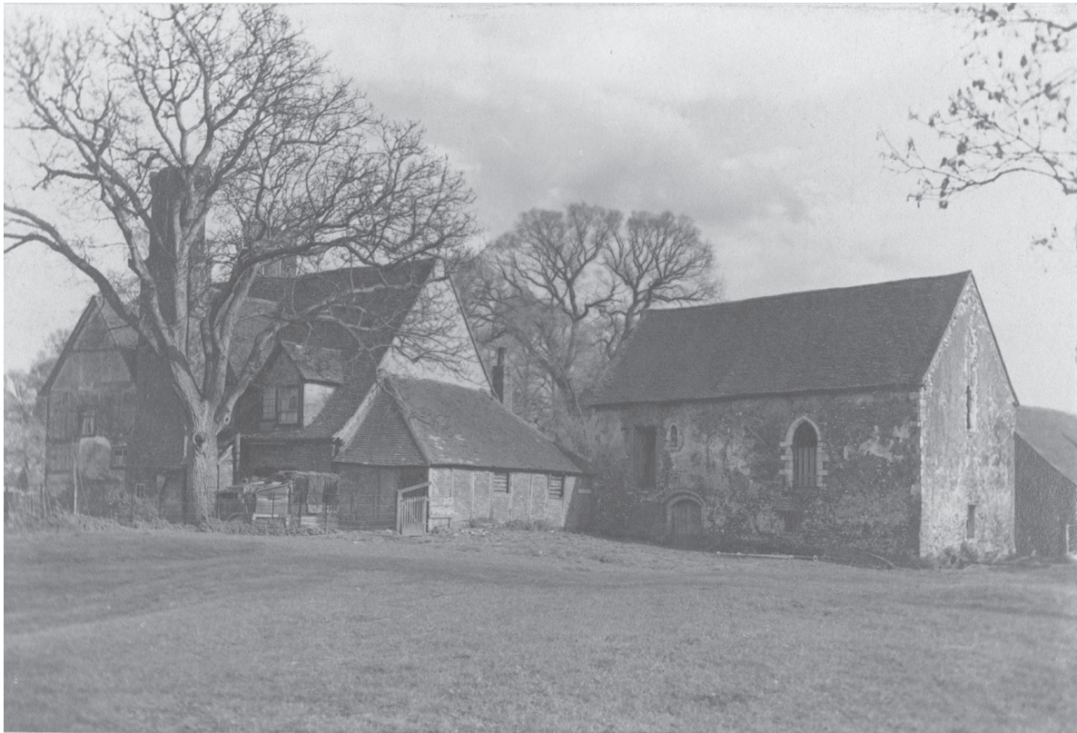
Fig 3. Moor Hall, Harefield, 1905