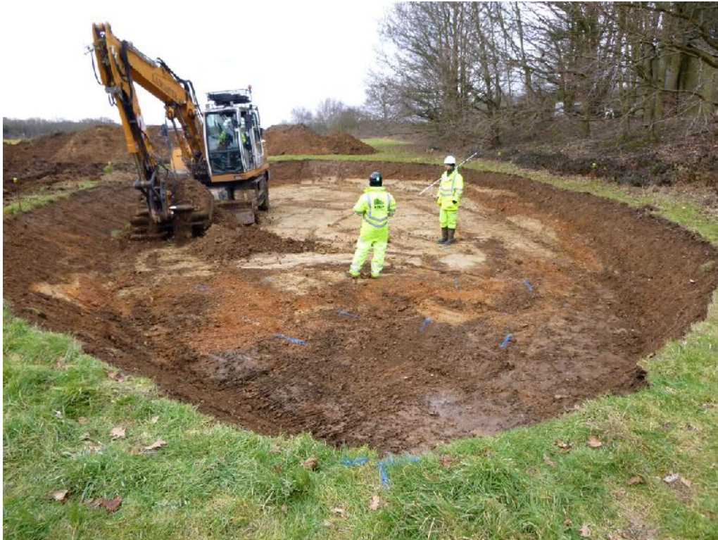
Plate 1: Excavation of Pond 1, facing north