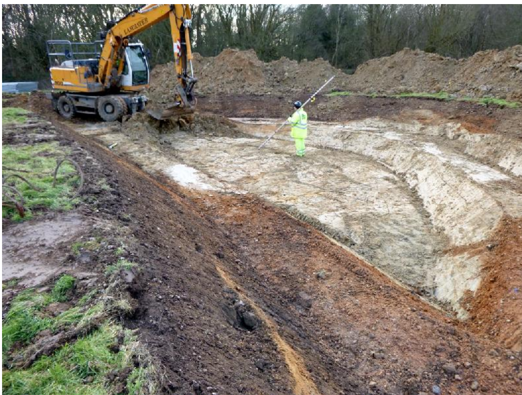
Plate 2: Excavation of Pond 2, facing southwest